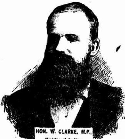
HON. W. CLARKE, M.P., Minister of Justice.