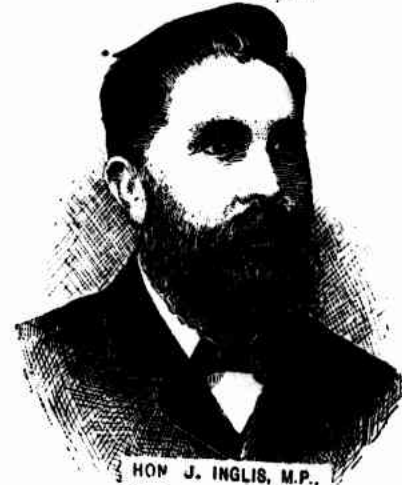
HON. J. INGLIS, M.P., Minister of Public Instruction.