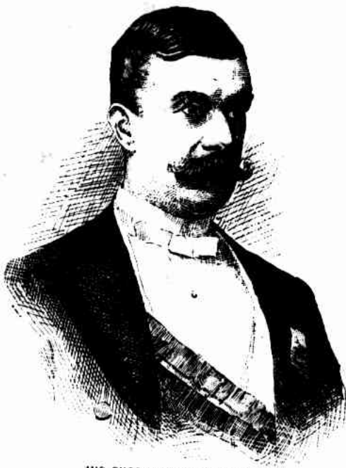
HIS EXCELLENCY THE GOVERNOR.