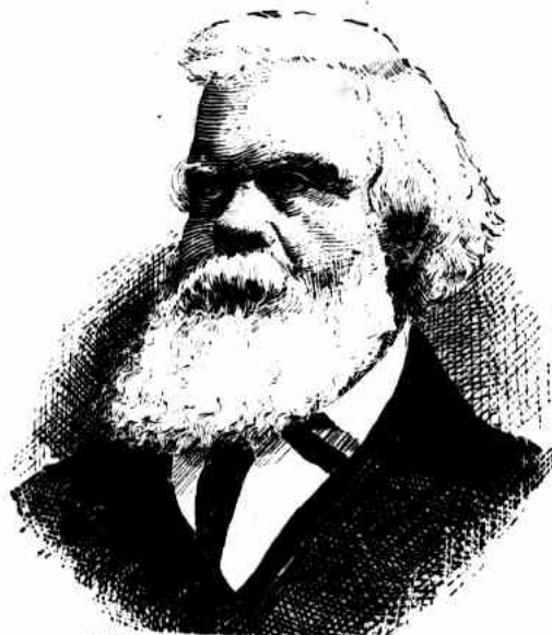
HON. SIR HENRY PARKES, K.C.M.G., M.P., Prime Minister and Colonial Secretary.