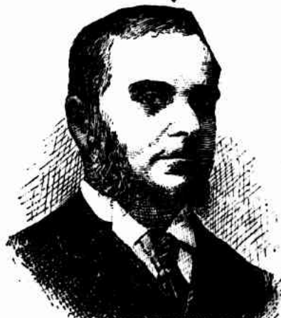
HON. J. E. SALOMONS, Q.C., M.L.C., Representative of the Government in Legislative Council.