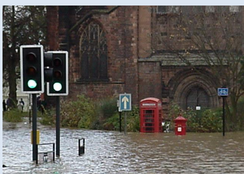
Autumn 2000 flooding in England and Wales: model results indicate that twentieth century anthropogenic GHG emissions increased the risk of floods of this magnitude by about a factor of two. [10].

Another important scientific development that is directly relevant to the Warsaw mechanism is extending PEA from hydro-meteorological events (e.g. heatwaves, floods, droughts) to their socio-economic impacts (e.g. crop failure). Attribution studies [20] are currently exploring the use of impact-relevant combinations of climate variables [21,22]. Quantified assessment of the socioeconomic loss and damage due to extreme weather events attributable to human influence on climate is possible in principle, but uncertainties increase due to confounding factors in the impacts of extreme weather events.