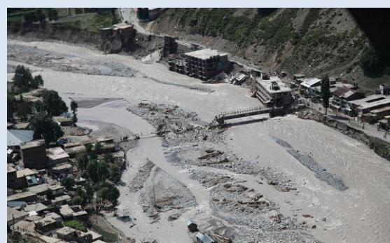
Pakistan floods 2010: a model evaluation study suggests that the model in question cannot provide reliable results for this event. This does not preclude further research but highlights that assessment is more difficult for some events than others. [19]