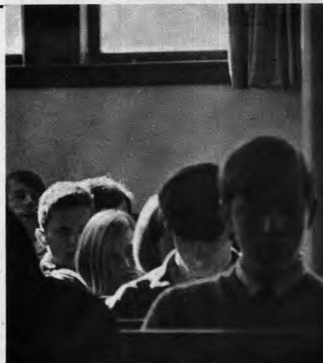
Oakwood Meeting for Worship