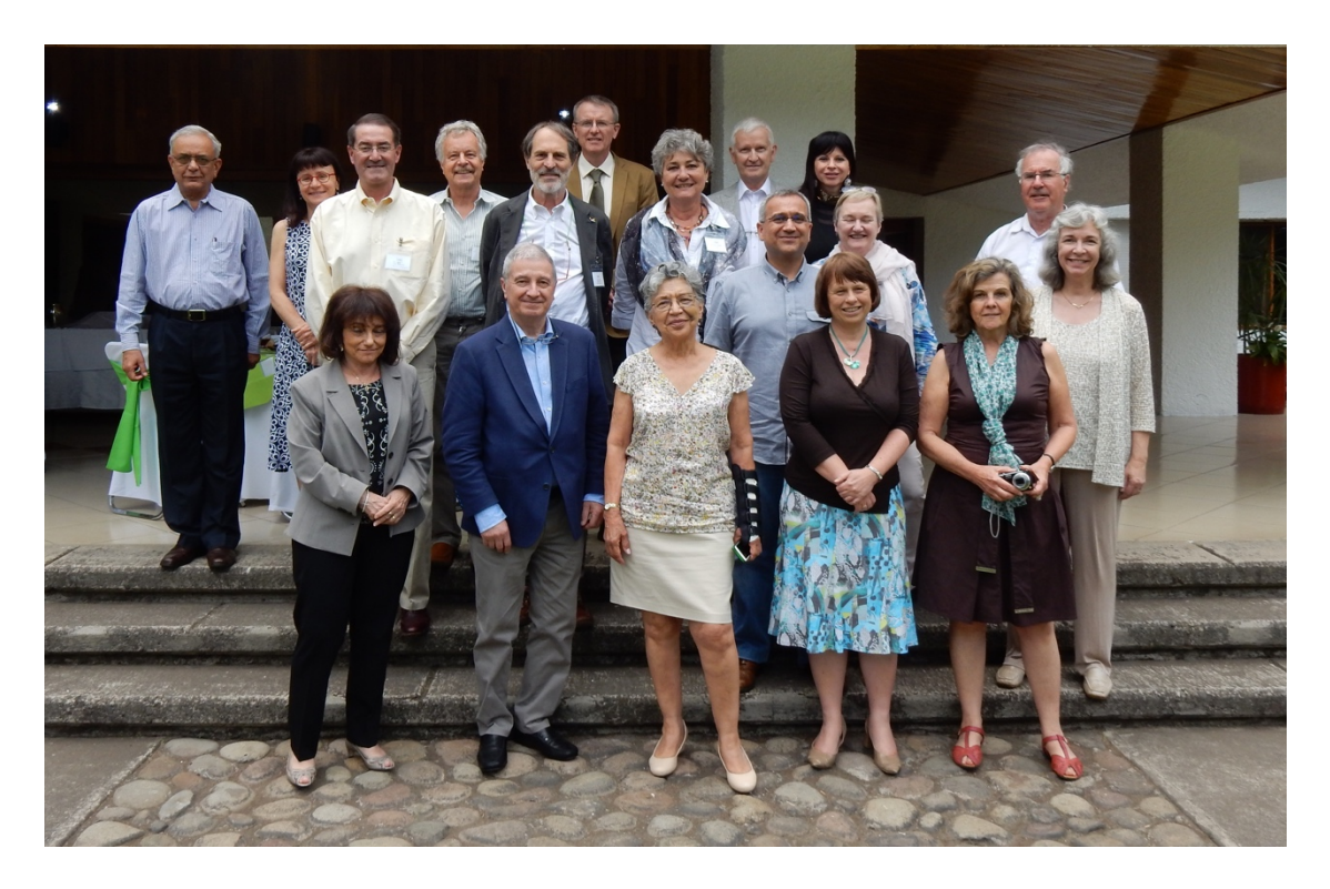
IAU EC Members and Division Presidents at the EC98 Meeting in Mexico City

The 98<sup>th</sup> Executive Committee Meeting of the IAU took place from May 4<sup>th</sup> to 6<sup>th</sup>, 2016 in Mexico City, hosted by the UNAM (Universidad Nacional Autónoma de Mexico) and was also attended by the Division Presidents. We present here an executive summary of the main items discussed and of the decisions taken.