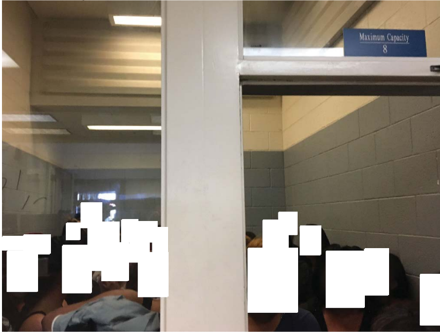
Figure 2: Overcrowding of Adult Females in PDT Holding Cell Observed by OIG on May 7, 2019