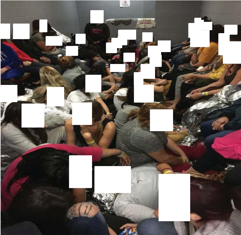
Figure 1: Overcrowding of Adult Females in PDT Holding Cell Observed by OIG on May 8, 2019