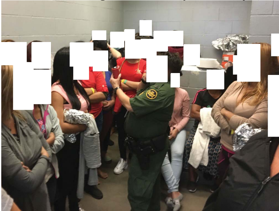
Figure 6: Armed Border Patrol Agent Verifying Temperature in PDT Single Adult Female Holding Cell Observed by OIG on May 7, 2019

In addition, Border Patrol management on site said there is an ongoing concern that rising tensions among detainees could turn violent. We observed that staff must enter crowded cells (see Figure 6) or move large numbers of detainees for meals, medical care, and cell cleaning. For example, at the time of our visit, 140 adult male detainees were crowding the hallways and common areas of the facility while their cell was being cleaned. We observed staff having difficulty maneuvering around this crowd to perform their duties, and were told that staff feel they have limited options if detainees decide not to cooperate.