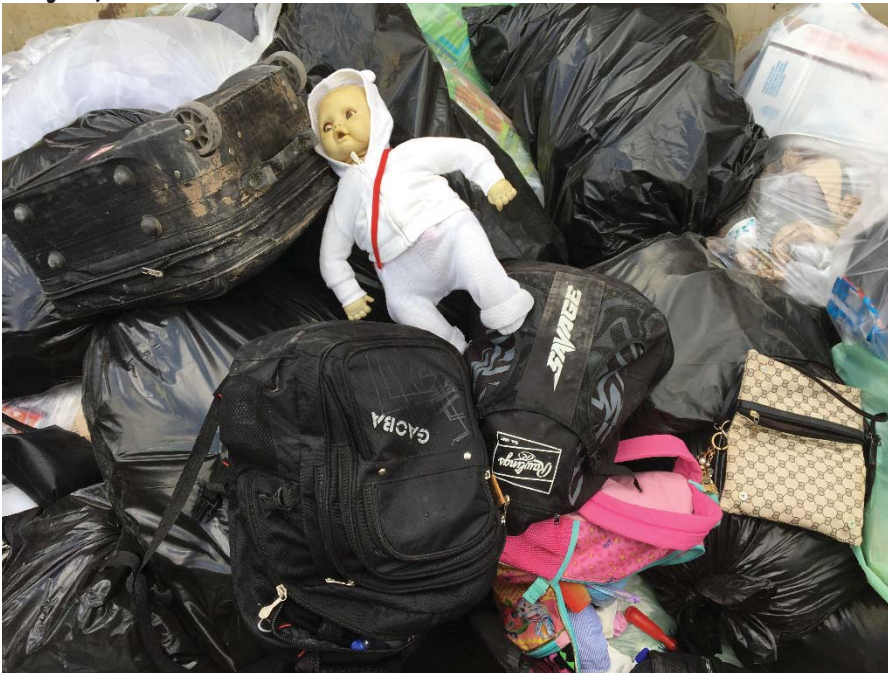
Figure 5: Dumpster with Detainee Personal Property Observed by OIG on May 8, 2019