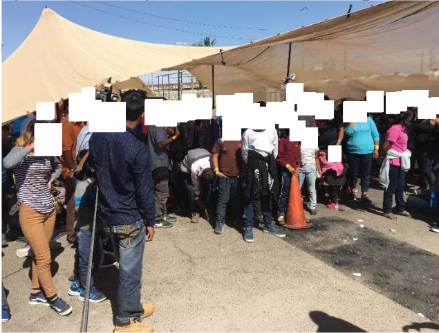
Figure 4: Family Units and Single Adults in the PDT Parking Lot Observed by OIG on May 7 and 8, 2019, Respectively