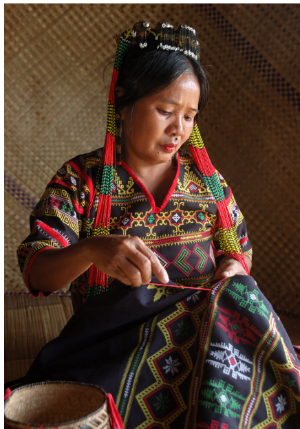
Master Embroiderers of Lake Sebu, South Cotabato.

The "Capacity Building for IP Leaders" and "Community Development, Para-legal Functions and Project Planning and Management" projects provided training on basic and advanced paralegal skills, leadership and gender sensitivity, community organizing, and project development and management to dozens of IP leaders and governmental staff. These sessions resulted in increased awareness of leaders and elders on leadership and gender issues, strengthened traditional structures of community development and law enforcement, and improved competence levels for integrating tribal and customary laws with national legal processes.