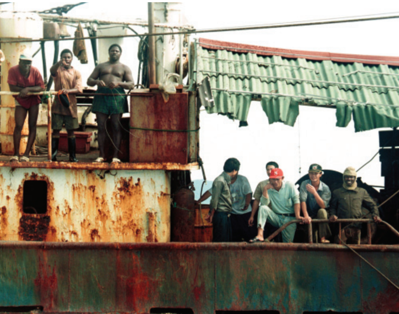
Close view of the crew aboard vessel in poor condition with visible evidence of rust and decay.

operating both on the high seas and within other countries' EEZs.