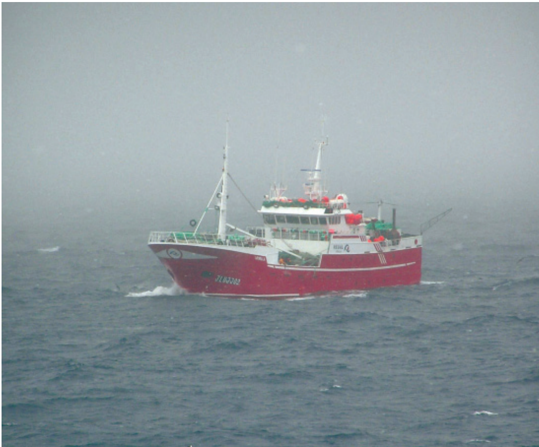
The Arneta , a licensed Spanish-flagged fishing vessel operating legally in international waters approximately 200 nautical miles south of the Australian fishing zone in the Southern Ocean.