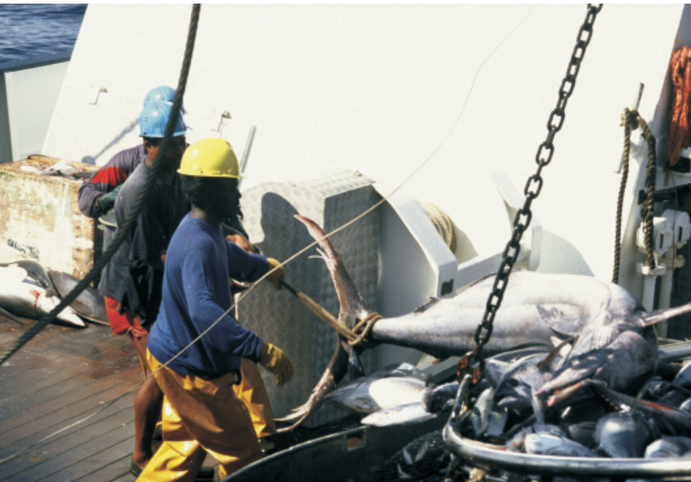
Bycatch of Billfish ( Treptarus audax ) and sharks. © WWF-Canon / H el ene Petit

Honduran flag, fishing vessels that intend to fish on the high seas need the “Authorization of the General Directorate of Fisheries and Aquiculture (sic); Legalized document that shows evidence of the installation of the satellite monitoring system;” and an “ Affidavit that states the non intention of fishing for tuna. ” 30