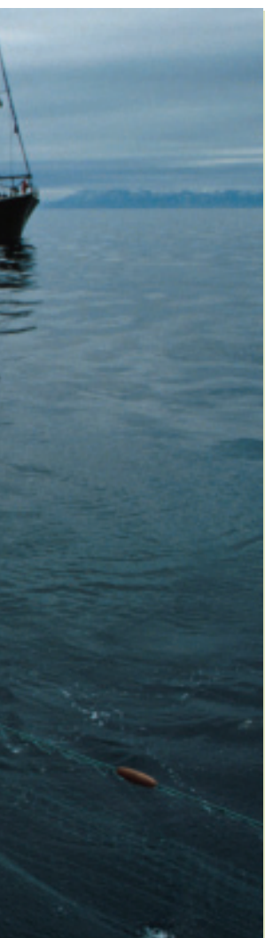
Greenpeace checks Japanese vessel Unitaka 15 for illegal fish and bycatches off Etorofu-to Island, Russia. Inflatable coming alongside; Rainbow Warrior in background. Fisherman on board Unitaka 15 hauling nets.

The seafood industry, including importers, wholesalers and retailers, has a special responsibility to take action to prevent, deter and eliminate IUU fishing by denying market access to IUU caught fish. Seafood industry associations in key market countries such as Japan, EU, the US and China should work with governments to adopt and enforce legislation to make it illegal to trade in IUU caught fish and fish products.