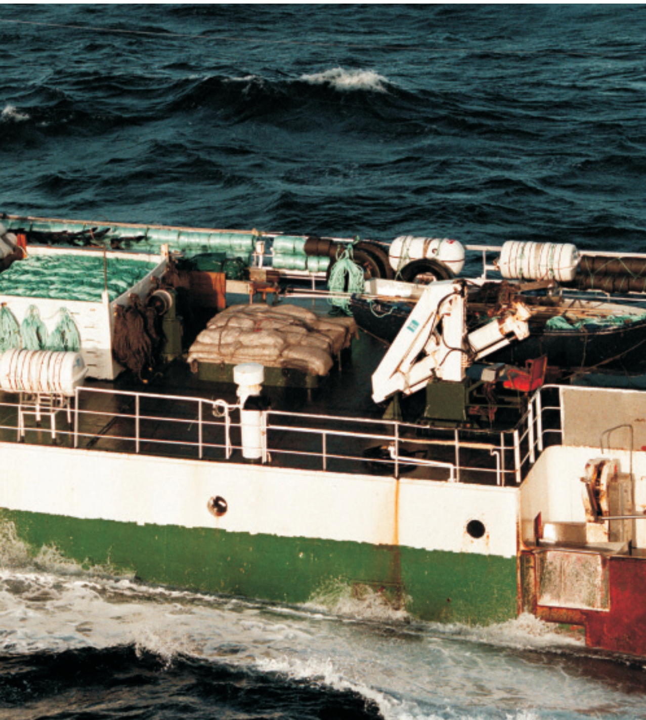
Illegal toothfish longliner Grand Prince from Belize, Indian Ocean.