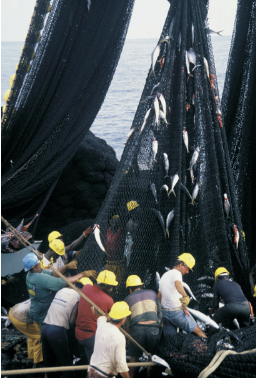
By-catch entangled in the net of a tuna purse-seiner. © WWF-Canon / H  l  ne Petit

standards and working conditions on board the vessels, are certain to be far higher than the revenue generated by the FOC system. Beyond this, the systematic failure of an FOC State to prevent its vessels from fishing in a region substantially increases the costs to responsible States of conservation and management of the fisheries of the region.