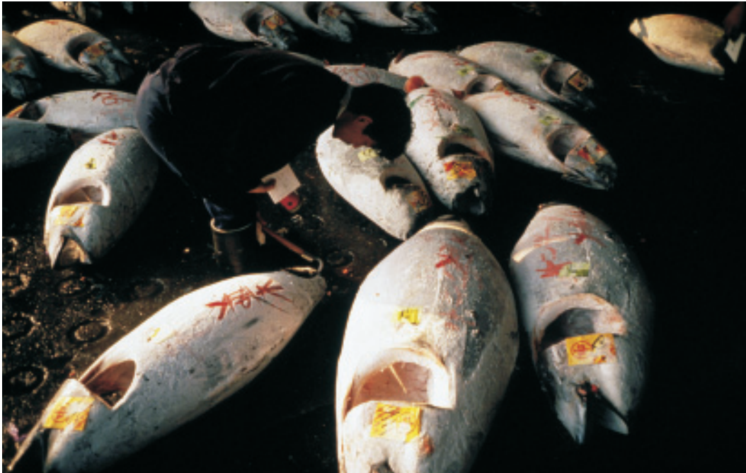
Marked and labelled bluefin tunas. Tokyo fishmarket, Japan.