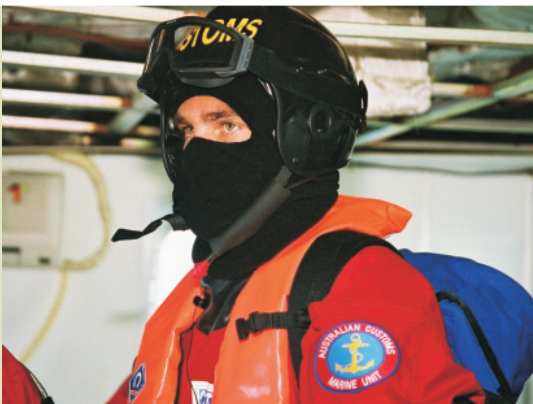
Australian Customs National Marine Unit officer in Southern Operation.

Section 2 uses the example of IUU fishing for Patagonian toothfish ('Chilean sea bass') in the Southern Ocean to review developments in the use of FOCs such as flag hopping. An apparent and more recent trend by companies and vessels with a history of IUU fishing to 'legitimize' their IUU activities by moving from the use of Flags of Convenience to registering their vessels to fly the flag of Commission for the Conservation of Antarctic Marine Living Resources (CCAMLR) member countries is also examined. This section also provides some very disturbing information on the abuse of human and workers' rights in these fisheries, a situation which has on occasion resulted in the deaths of seafarers.