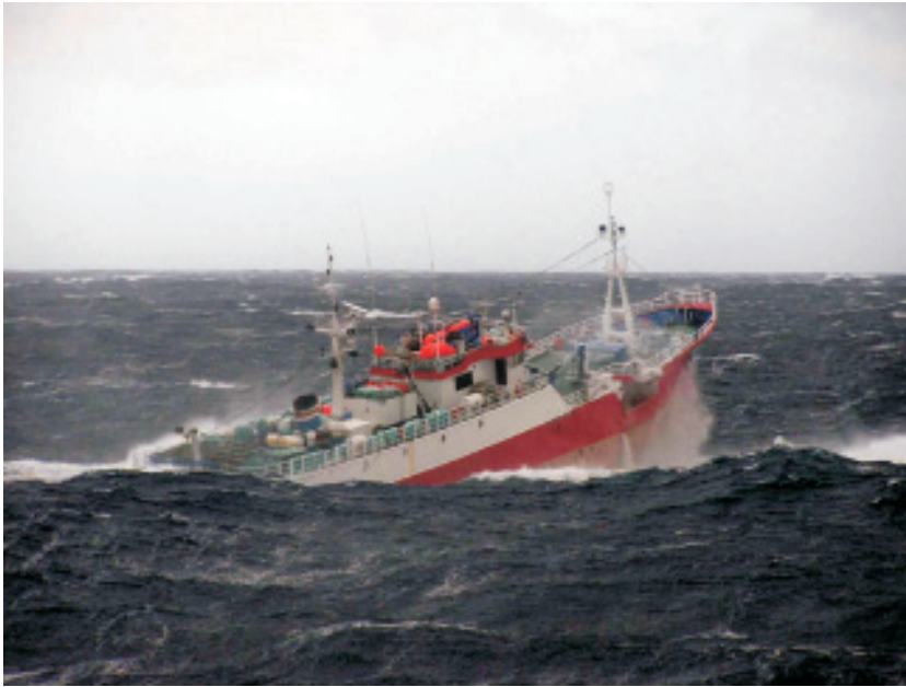
The Uruguayan-flagged, Viarsa 1 , suspected of fishing illegally for Patagonian toothfish in Australian Antarctic waters, was apprehended in August 2003 after a marathon hot pursuit across the Southern Ocean. The vessel was apprehended with assistance from the South African and United Kingdom authorities, and brought back to Australia.

Sections 3 and 4 provide detailed information on the global infrastructure for at-sea transshipment of fish catches and the refuelling and resupply of distant water fishing vessels operating on the high seas – both IUU and legitimate fishing vessels. This section identifies opportunities to regulate transshipment at sea, which provides a major avenue for the movement of high value IUU caught fish such as tunas to market. These regulations would strongly enhance the effectiveness of measures to prevent or eliminate IUU fishing, particularly for high value species of tuna as well as other high seas fisheries that depend on at-sea infrastructure to support their operations.