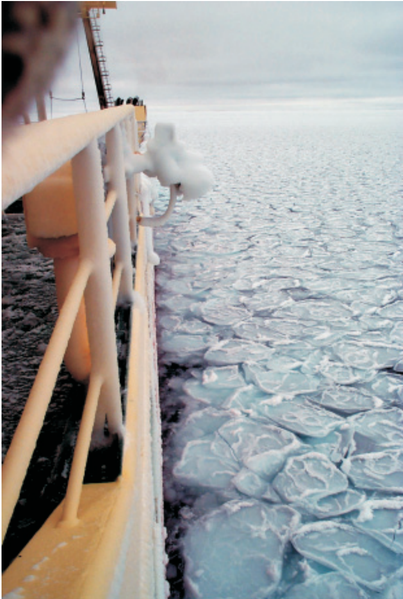
Ice on the Southern Ocean.