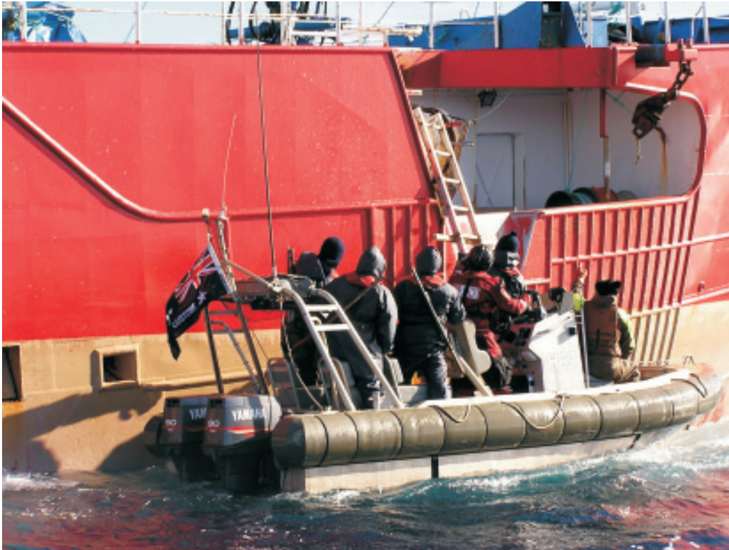
Australian Customs Service staff board the IUU boat, Viarsa , caught stealing Patagonian toothfish in the Southern Ocean in 2003.

number of vessels flagged to all four countries combined fell from over 1,117 to 953, a decrease of approximately 15% (Belize declined by approximately 40%). Nevertheless, all four countries remained at the top of the list of FOC countries in terms of the numbers of large-scale fishing vessels on their registries, with over 950 large-scale fishing vessels on their registries combined in 2005.