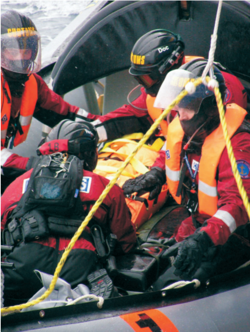
The Australian Customs medical team transfers a sick fisherman onto the Oceanic Viking mid-Southern Ocean from the Arnela , a licensed Spanish-flagged fishing vessel operating legally in international waters approximately 200 nautical miles south of the Australian fishing zone in the Southern Ocean.

RFMOs to consider making adherence to the standards and working conditions in these instruments a criteria for vessels to receive authorization to fish within the area of competence of the RFMO.