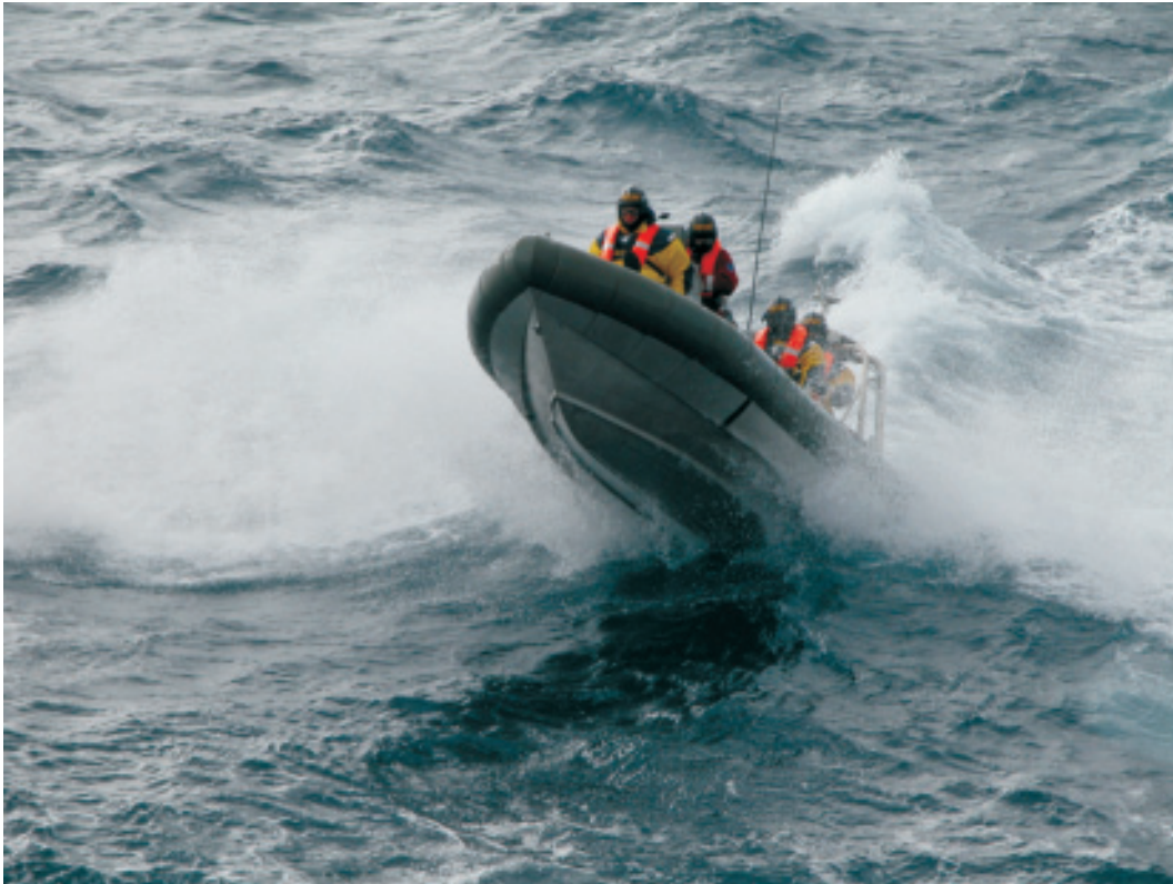
Australian Customs officers in a rigid inflatable vessel on a Southern Ocean operation.

at-sea infrastructure servicing high seas and distant water fleets and provides specific recommendations for regulating the companies and vessels providing these services.