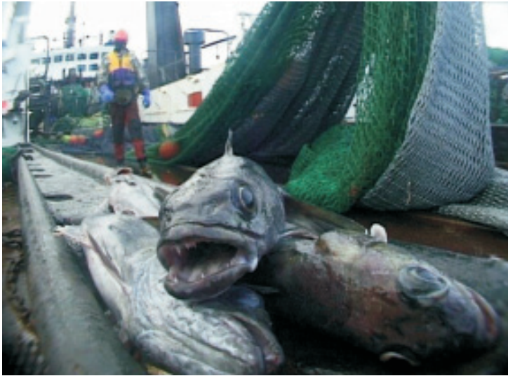
Confiscated illegal catch of Patagonian toothfish (also known as Chilean Sea Bass or Miro).

The study analyzed information available from the Lloyd's Register of Ships between 1999 and 2005 on fishing vessels registered to the top 14 countries that operate open registries or 'Flags of Convenience' for large-scale fishing vessels. Over 1,000 large-scale fishing vessels continue to fly Flags of Convenience (FOCs) as of July 2005, in spite of significant global and regional efforts over recent years to combat IUU fishing on the high seas, primarily by FOC fishing fleets. The FOC system provides cover to a truly globalized fishing fleet engaged in what is largely illegal or unregulated fishing activity on the high seas, to the detriment of international efforts to conserve fisheries and protect other species in the marine environment. Many, if not most, of these vessels deliberately register with FOC countries to evade conservation and management regulations for high seas fisheries. The countries which issue FOCs are ultimately responsible for the activities of these vessels on the high seas, but turn a blind eye and exercise little or no control over the vessels concerned. It costs only a few hundred dollars to buy an FOC, and with that FOC vessels and fishing companies are free to catch millions of dollars worth of fish and threaten other forms of marine life on the high seas with impunity.