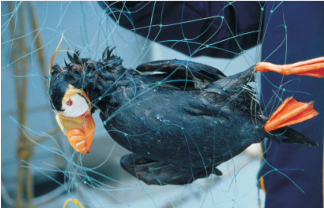
Dead Puffin found by Greenpeace in illegal driftnet. Kuril Islands, Russia.

large-scale fishing fleet to be categorized as either FOC or flag 'unknown' and potentially engaged in IUU fishing on the high seas.