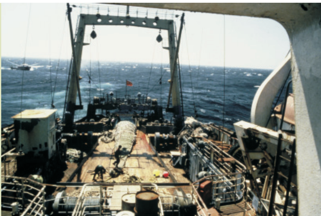
Work deck of a Russian trawler.

and oversight system in terms of flag State compliance is a major weakness under the UNCLOS regime. There is a clear need to balance flag State sovereignty with flag State responsibility – the exercise of effective oversight over vessels which fly its flag, meaning compliance with the duties, obligations and responsibilities established by international law and the treaties to which the flag State is party to. It is hard to see how a flag State can exercise effective oversight over the vessels that fly its flag and, where necessary, impose sanctions to discourage violations in the absence of a genuine link between the vessel and the flag it flies. This genuine link requires that the vessel be beneficially owned and controlled in the flag State and that there is a substantial economic entity and assets with the territory of the flag State.