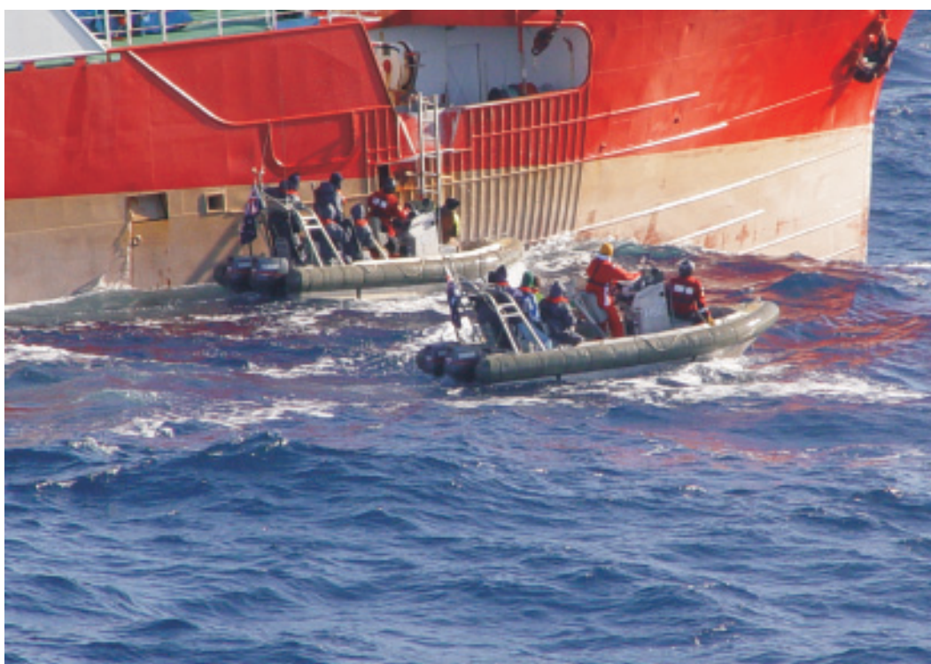
Australian Customs Service staff board the IUU boat Viarsa , caught stealing Patagonian toothfish in the Southern Ocean in 2003.

It is difficult to overstate the importance of tankers and resupply vessels to the operations of high seas fishing fleets, including IUU vessels. Given the size, scope, visibility and the diversity of the operations of major companies involved in the business, individual States within whose jurisdiction the owners or managers of these vessels reside, as well as RFMOs within whose areas these vessels operate, should directly engage the companies involved. They may well be amenable to cooperating in international efforts to prevent, deter and eliminate IUU fishing, whether through observer programs, bringing company policies and business practices into line with RFMO recommendations, and/or by other means. Integrating tankers and resupply vessels and the companies that own, manage or charter these vessels into regional efforts to ensure effective compliance with RFMO measures is a necessary and potentially very effective means of combating IUU fishing.