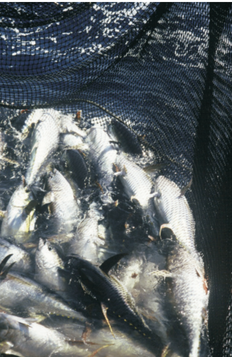
Tunas in seine net. © WWF-Canon / H el ene Petit

RFMOs with competence over fisheries for straddling and highly migratory fish stocks and fisheries for discrete stocks on the high seas should apply similar measures to all vessels transshipping at sea. Such measures should include: