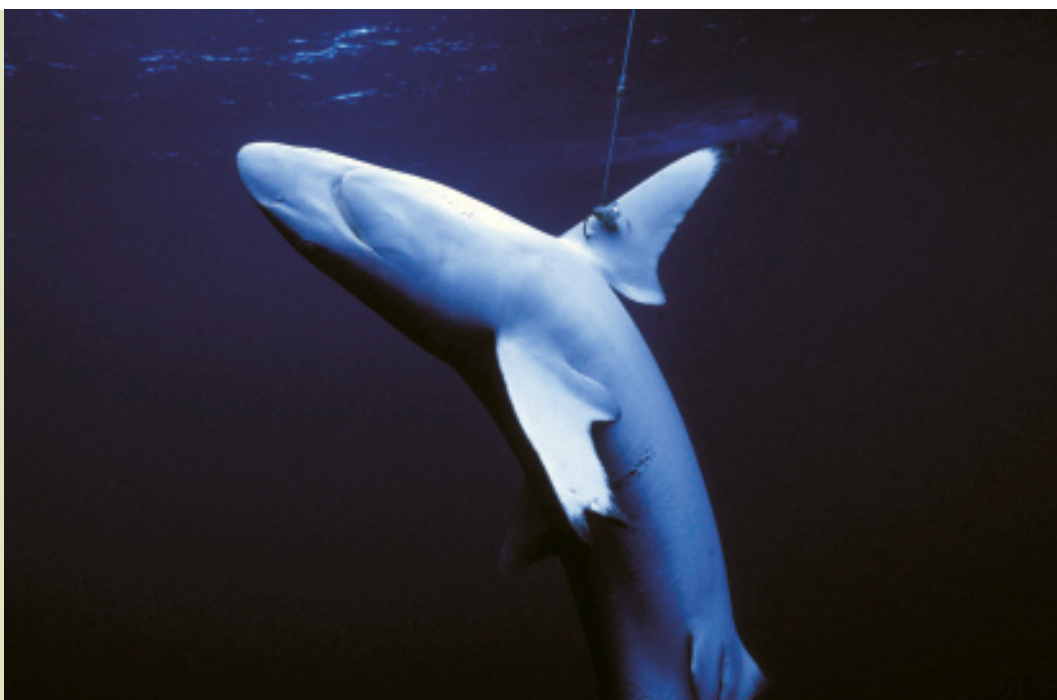
Silky shark caught by the fin on a longline hook.

Nonetheless, a recent report by the Marine Resources Assessment Group roughly estimated that the annual value of IUU fishing on the high seas could be in the vicinity of