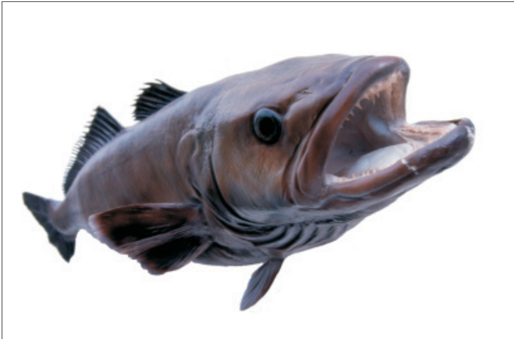
Patagonian toothfish (also known as Chilean Sea Bass or Miro).

most egregious offenders amongst the IUU operators in the Southern Ocean.