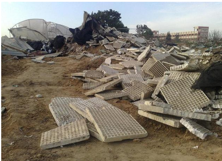
Destroyed vegetable nursery, Al Zeitoun

In the post-conflict phase, FAO will continue to coordinate sectoral efforts to meet new demands. This will include assisting service providers and facilitating market mechanisms to ensure that locally produced food is available and affordable, including meat, eggs, dairy products, fruit and vegetables. Furthermore, FAO intends to restart projects stalled during the closure and conflict, which address the ongoing needs of fishers, small-scale livestock farmers and especially vulnerable groups such as female-headed households.