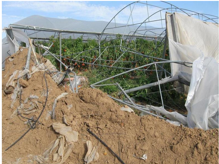
Damaged greenhouses, Beit Lahia

FAO is initiating immediate emergency interventions valued at USD 1.3 million to provide assistance to the most vulnerable farming families. Interventions include the distribution of input packages for plant production (including vegetables, orchards and date palms), livestock production, aquaculture and household food production/backyard cottage industries. Part of the strategy to assist the hardest hit families is through cash-for-work programmes. FAO will also focus on repairing damage to greenhouses, animal sheds and water resources, including irrigation networks and water wells.