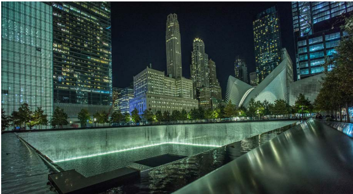
Ground zero memorial in New York.

The 9/11 attacks were justified by most jihadi-Salafi ideologues based on classical legal concepts such as al-wala' wa al-bara' , takfir , and qisas . Although these ideologues generally agreed on the impermissibility of targeting non-combatant women and children, they authorised killing them when avoidance is impossible.