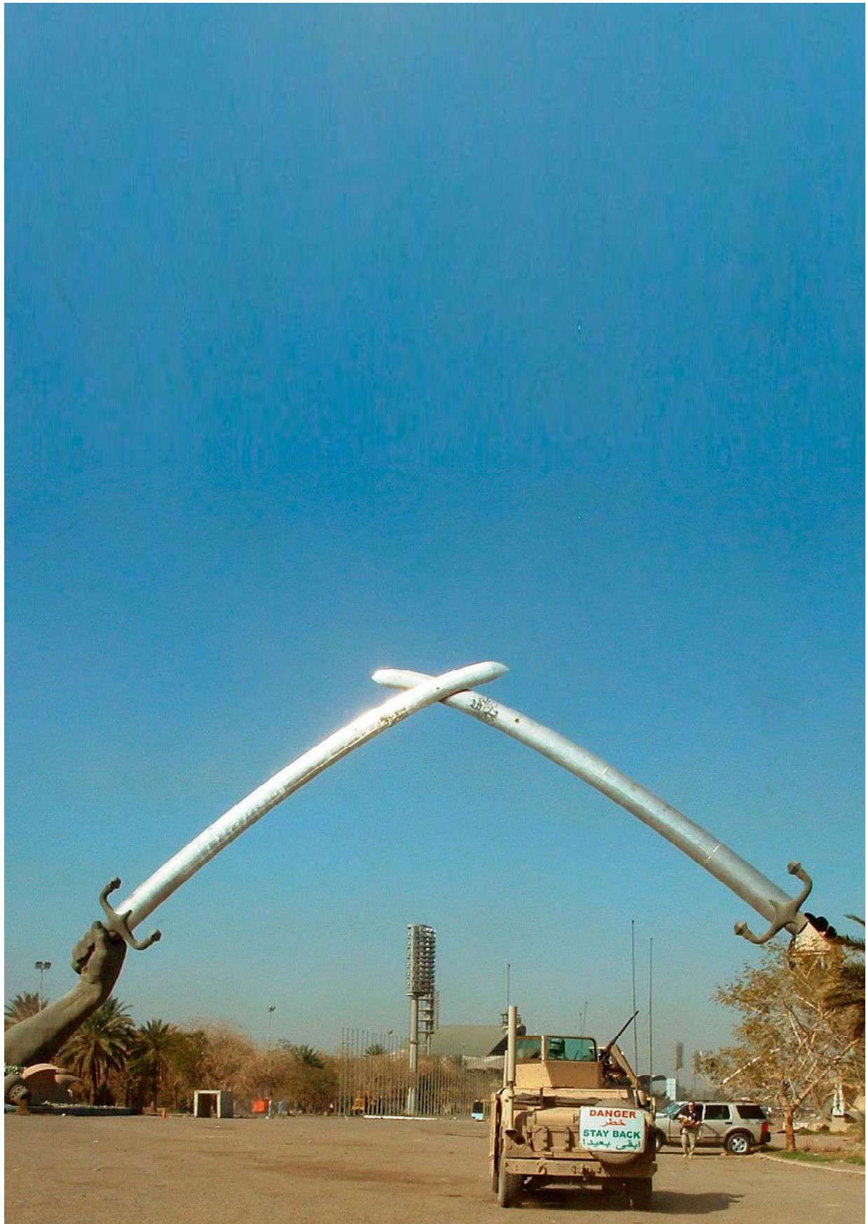
The Victory Arch (Qaws an-Nasr) in central Baghdad, Iraq.