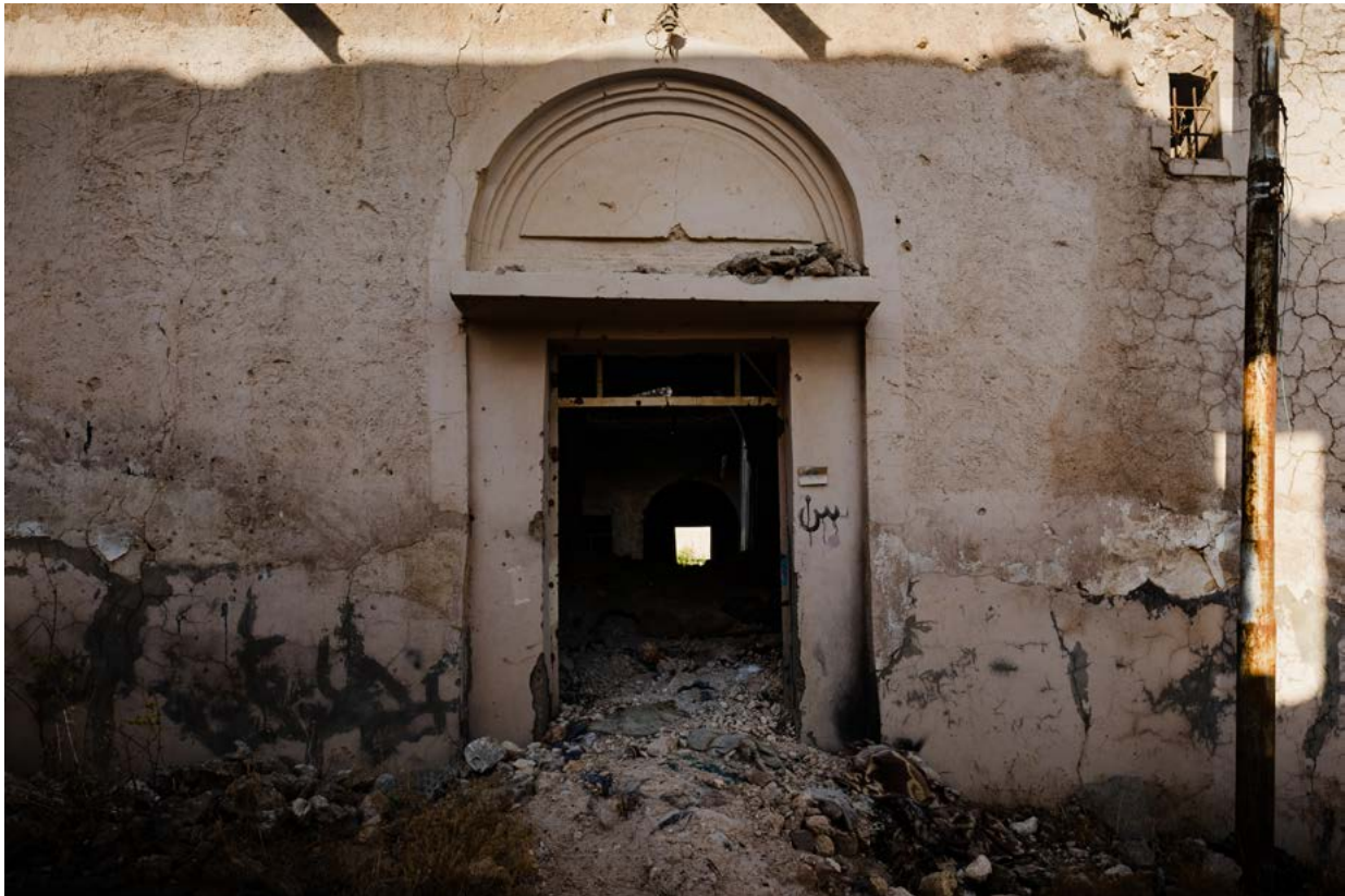
A ruined old home in Sinjar following the war with the Islamic State.

Less than a year after his statement, Abu Omar al-Baghdadi was killed along with the ISI war minister by Iraqi and US forces. While the US initially claimed a strategic victory, ISI's ability to adapt to new realities, American mistakes during and after the invasion, along with the unaddressed and increasing grievances of the Sunni population resulting from the sectarian policies of Iraq's predominantly Shi'a government allowed ISI to return.