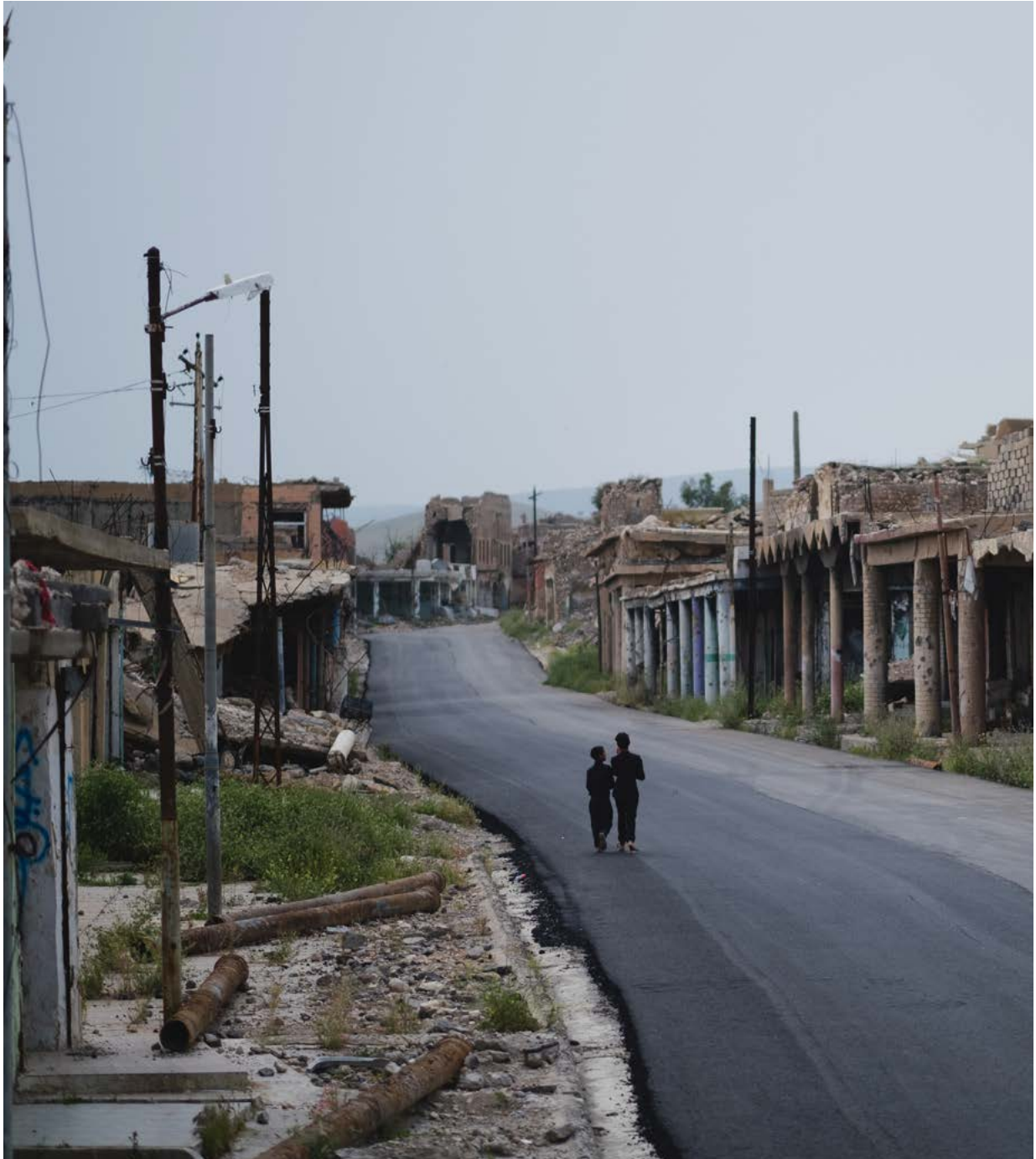
Children walking through the ruins of the old marketplaces in Sinjar, following the war with the Islamic State.

and the link between the two is inseparable. Society, nowadays, exists as a state of jahiliyyah because although it claims to be Muslim and practices Islamic duties, such as prayer and fasting, it is governed by manmade laws instead of Allah's ordained revelation. To end this state of jahiliyyah , society must apply al-hakimiyya , which can be only achieved by toppling the existing political system through waging jihad against it.