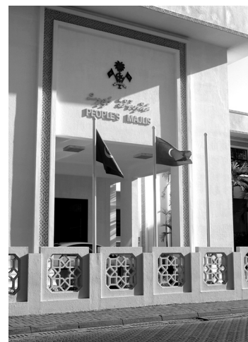
The Majlis (Parliament)

The 2008 constitution guarantees most of Maldives’ human rights obligations; however these have so far failed to be translated into domestic law. In the interim period, the General Regulations Act passed in 2007 constituted a parent legislation for over 80 regulations 16 , and prolonged the lifespan of these regulations for a one-year period until new legislations were to be adopted to reflect the constitutional changes. The Act has been renewed every year since 2007 to prevent a legal void. It was once again renewed on 5 th August 2012 until April 2013. 17