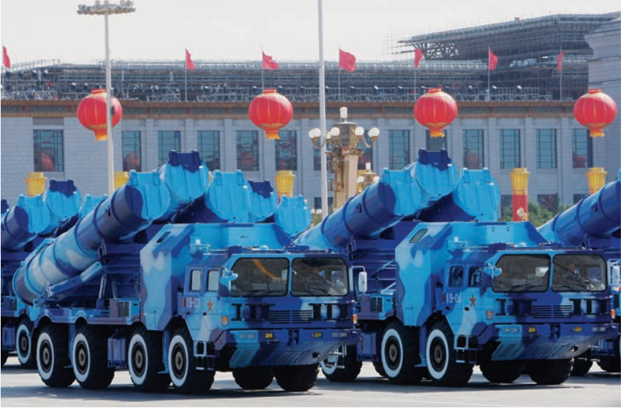
DH-10 LACM transporter erector launchers in 2009 Beijing parade