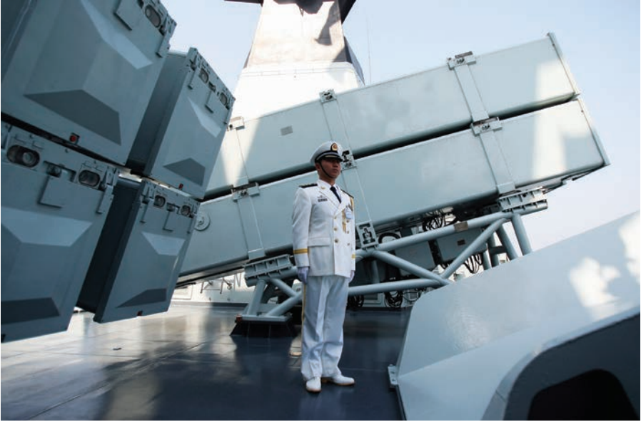
PLA Navy sailor stands on deck of a Jiangkai frigate with YJ-83 ASCM canister launchers