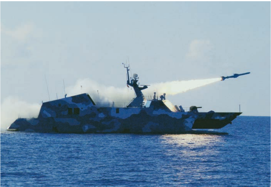
Type-022 Houbei -class catamaran firing one of its eight YJ-83 ASCMs