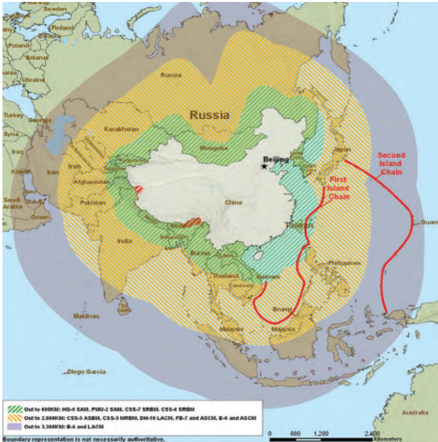
Figure 3.1. China's Conventional Antiaccess/Area-denial (A2/AD) or "Counter-intervention" Capabilities

Ground-launching requires an additional small rocket booster to get the missile off the launcher whereupon the engine is ignited until the missile flies aerodynamically. Air-launching does not require a booster rocket, but only a release mechanism to drop the missile away from the aircraft before the engine takes over. The Chinese have air-launching capabilities as evidenced by the YJ-63 LACM, which is carried by the