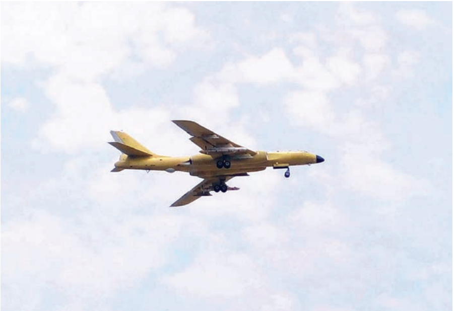
H-6K bomber carrying CJ-10 LACMs