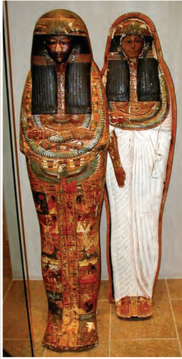
Fig. 7. Coffin set of Iy-neferty, a Theban lady of the New Kingdom, showing the deceased in pure white dress on the interior mummy board but in Osirian style on the coffin lid. Now in New York, at the Metropolitan Museum of Art. Accession number 86.1.5a–c, purchased with funds from various donors.

below the breast and the other flat on the thigh. Interestingly, this feminized depiction of the deceased was only placed inside her coffin. It was her outer coffin that transformed her more clearly into a masculinized manifestation of Osiris. In fact, the coffin betrayed her gender only with abbreviated and unnaturalistic breasts and a feminine wig. Like Henut-mehyt's coffins, this coffin set relied on flexibility of gender. Both the anthropoid coffin and the mummy board depicted the woman with dark red skin, a color typically reserved for men but often used for females during the reign of Ramesses II, including Queen Nefertari in her tomb in the Valley of the Queens (McCarthy 2002; Harrington 2005). The placement of the feminized mummy board inside an androgynous anthropoid coffin suggests that the masculine and Osirian transformation Iy-neferty had to undergo was somehow partial or temporary and would not affect her final, intended nature.