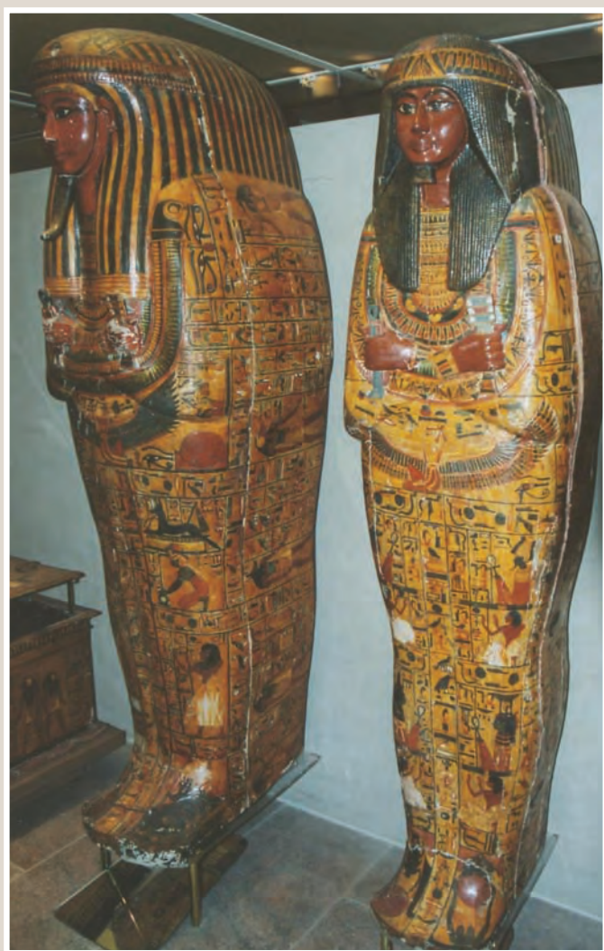
Fig. 11. The outer and inner coffins of Khonsu, a New Kingdom artisan from ancient Thebes. Now in New York, at the Metropolitan Museum of Art. Accession numbers 86.1.1a–b, purchased with funds from various donors.