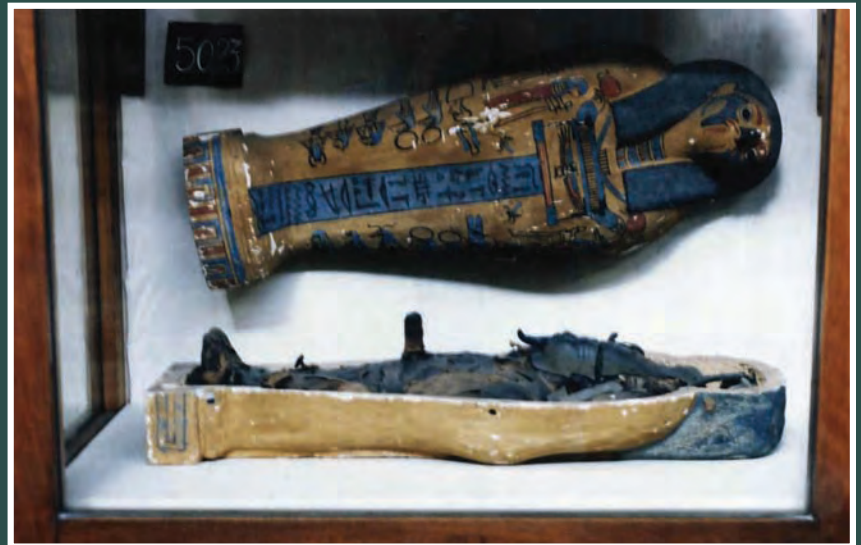
Fig. 4. A so-called “corn mummy” placed in a Late Period tomb, representing Osiris ready to bring about his own resurrection. Now in the Egyptian Museum, Cairo.

ary of the common folk. I am Orion who treads his land, who precedes the stars of the sky which are on the body of my mother Nut, who conceived me at her desire and bore me at her will. (Faulkner and Goelet 1994, 107)