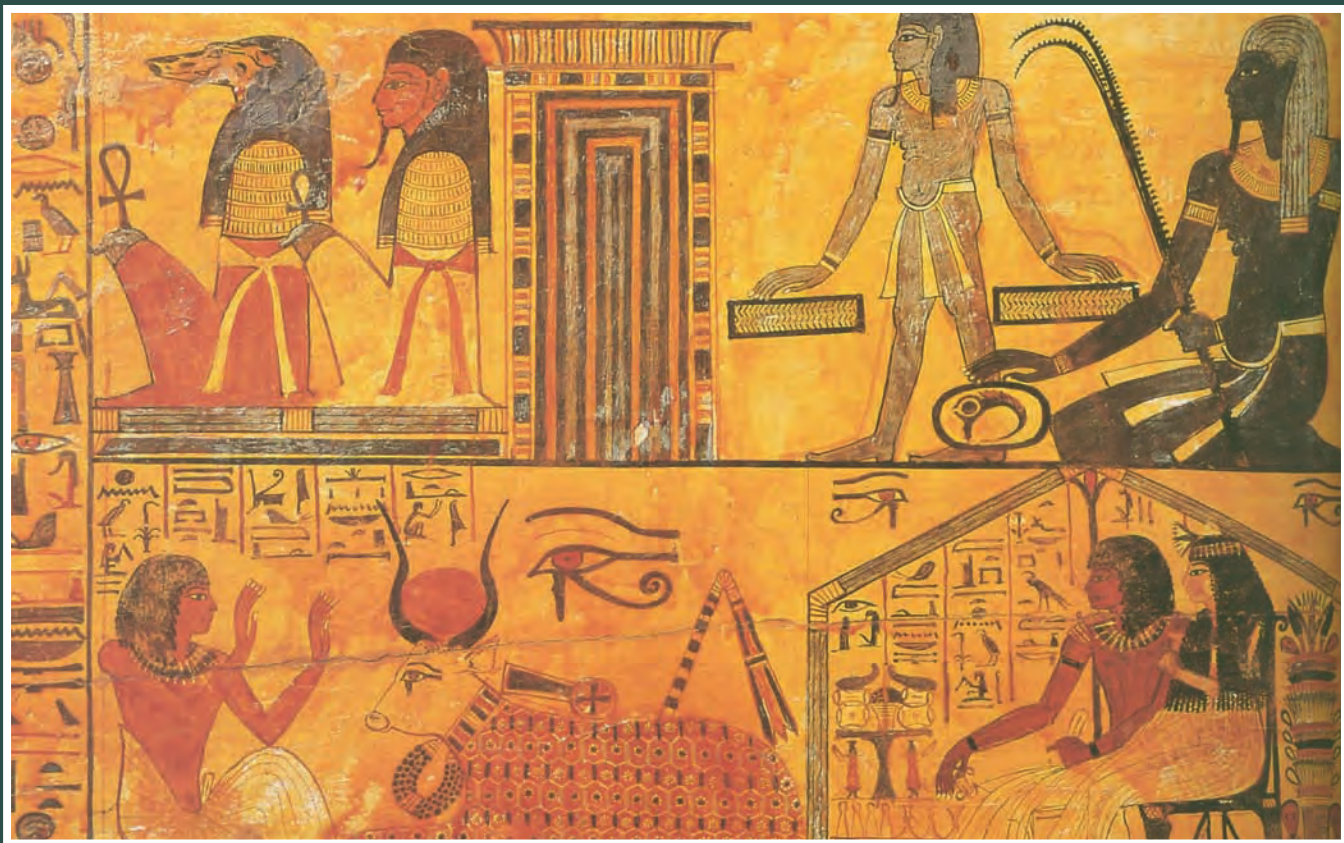
Fig. 8. One of the painted vignettes on the sarcophagus of Sennedjem, a New Kingdom artisan, showing him and his wife wearing pure white. Now in the Egyptian Museum, Cairo. Accession number JE 27301.

These correlations between particular funerary objects and human manifestations cannot and should not be understood as exact. Nonetheless, it is possible that such innovative and multilayered depictions of the deceased represented the fragmentation of the individual at death and his or her subsequent reconstitution into a whole being—within the material matter of the coffin set itself. In fact, it is possible to see the coffin of Iset as representing two stages of her afterlife journey simultaneously on one funerary object: the masculine transformative