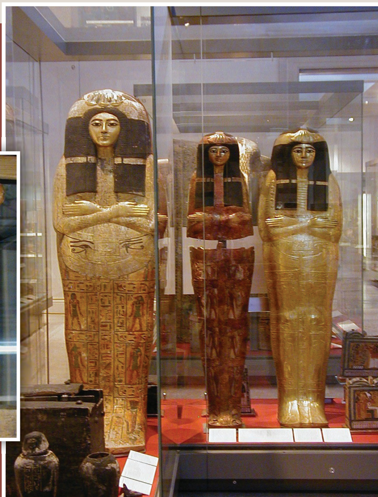
Fig. 6 (above). The coffin set of Henut-mehyt, a wealthy Theban woman. Now in London at the British Museum. Accession number EA 48001.