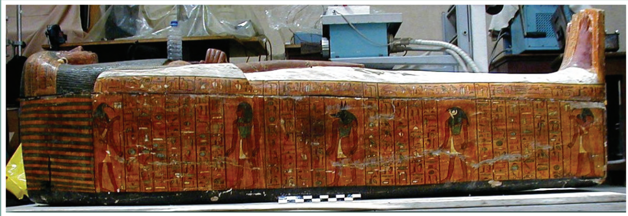
Fig. 9. The coffin of Iset, a New Kingdom lady depicting the deceased dressed in pure white on the lid and with transformative Book of the Dead texts on the case sides. Now in the Egyptian Museum, Cairo. Accession number JE 27309a.

moment of rebirth; and the end result—a peaceful afterlife in the duat netherworld, which for her would have been spent as a pure feminine being. We should not forget that all Egyptian art, especially funerary art, was performative, with every image and hieroglyph functioning to bring about a desired reality.