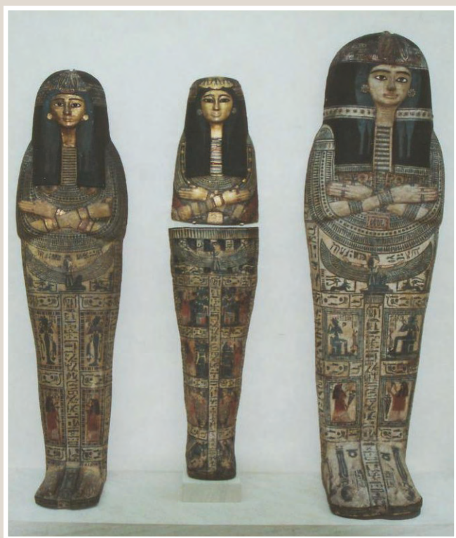
Fig. 10. The four-piece coffin set of Ta-kayt, a Theban lady of the New Kingdom. Now in Frankfurt, in the Städtische Galerie Liebieghaus. Accession numbers 1651a–f.

“ Ancient Egyptian funerary equipment expressed and adapted to the fragmentation of the human being at death. ”