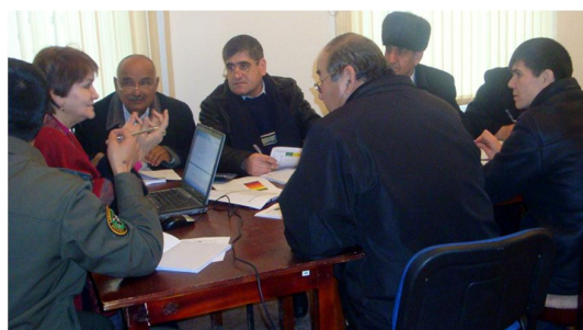
Experts in Khatlon classify the cluster