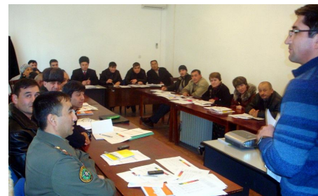
Khatlon: presenting food security situation

The IPC is conducted in a participatory manner involving a wide range of food security stakeholders. Their goal is to produce an accurate picture of the food security situation after the harvest, before the winter and during the lean season. For each round of an IPC, six workshops are held bringing together over 120 specialists from all four regions of the country to examine data and research on health and nutrition, water and food access/availability, income and employment, crop yields, coping strategies and other essential indicators for food security.