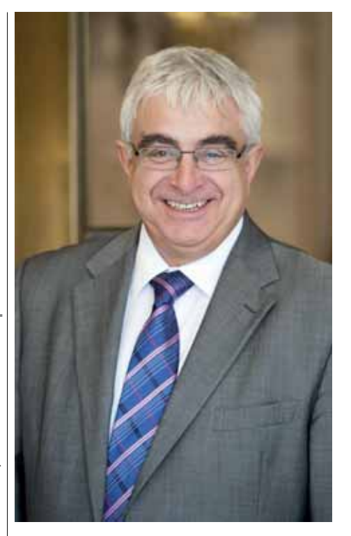
■ What does Poland need to do to attract more international meetings, conferences and congresses?

My recent visit to Poland was the first in over seven years and I was surprised and impressed at the extent of the meetings infrastructure in Warsaw. It's important for destinations to market themselves but this needs to be done in a planned and realistic way. The role of city and national convention bureaux is vital.