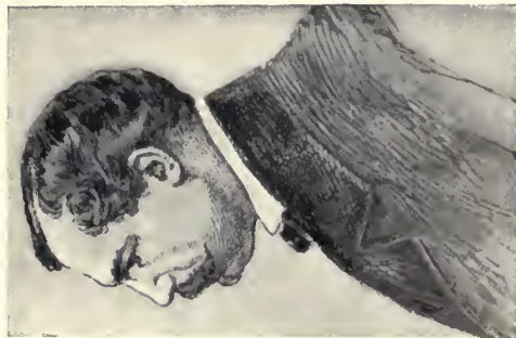
JULES DE GONCOURT.