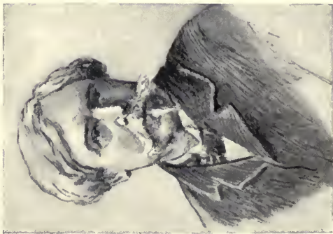
EDMOND DE GONCOURT.