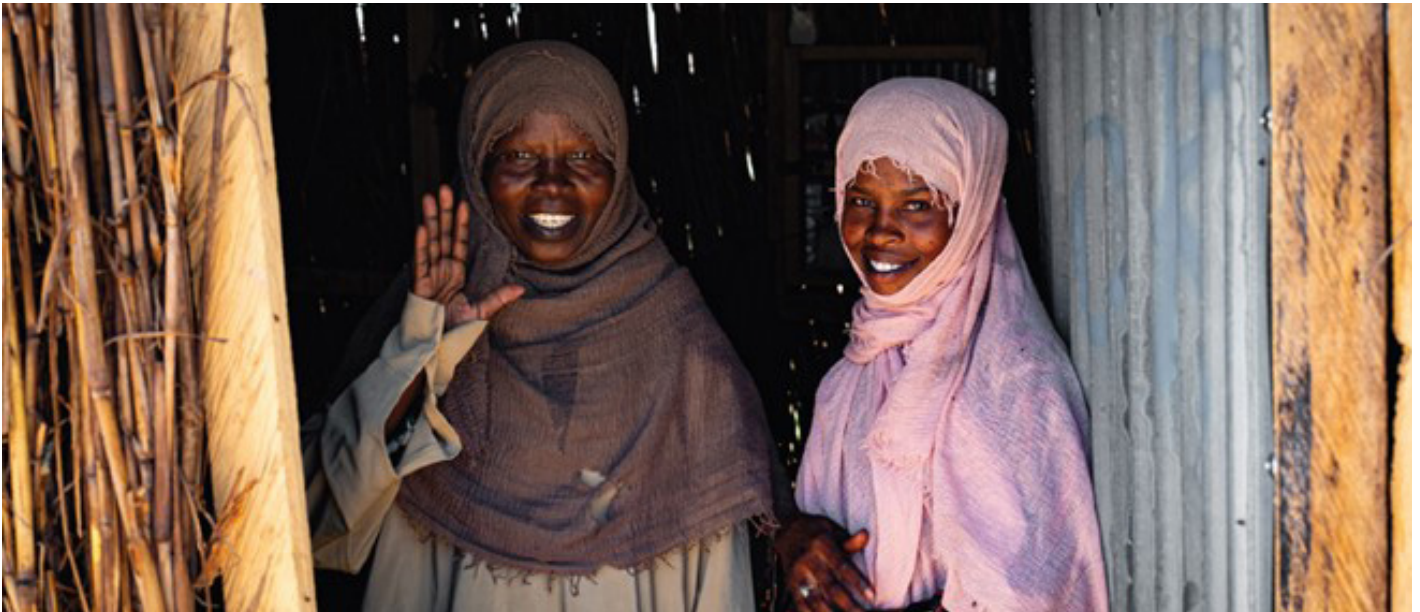
Two returnee women in their new shelter in Tongori site, Ouaddai province.

During the past week, protection staff identified 1,908 individuals in households with one or more vulnerable household members. IOM continues to respond to the need for immediate action to strengthen GBV responses in-country, particularly in Northern Bahr el Ghazal state. IOM's GBV specialist monitored the CMR capacities of health providers located closest to the main border points and liaised with the authorities to secure two premises to open safe spaces for women and girls. At the country level, IOM supported the Rapid SEA Risk Assessment, led by the PSEA task force, in Bulukat transit centre (TC) as well as the Interagency Rapid Assessment in Renk.