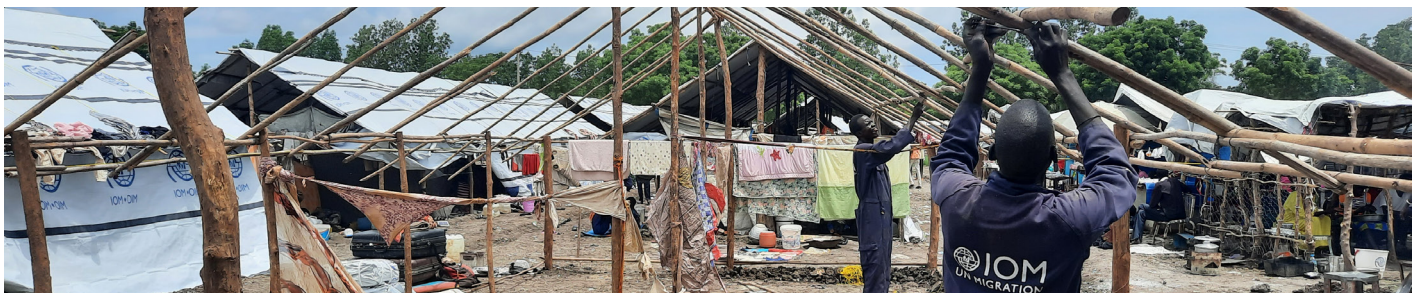
CCCM casual workers erecting a communal shelter to accommodate new arrivals in Bulukat TC

On 10 September, Under-Secretary-General for Humanitarian Affairs and Emergency Relief Coordinator, Martin Griffiths, spoke to Hemedti stressing the urgent need to increase access to people in need. On 11 September, High Representative of the European Union for Affairs and Security Policy, Josep Borrell, called for an end to attacks that target civilians. Rains and flooding will continue to compound the situation further, approximately 360 houses were impacted by the heavy rains in Gedaref on 2 September. In North Kordofan, over 540 households were impacted as a result of the heavy rains and flooding. IOM and partners continue to respond to the growing needs in Sudan and neighbouring countries, identifying avenues to deliver humanitarian assistance across hard-to-reach areas.