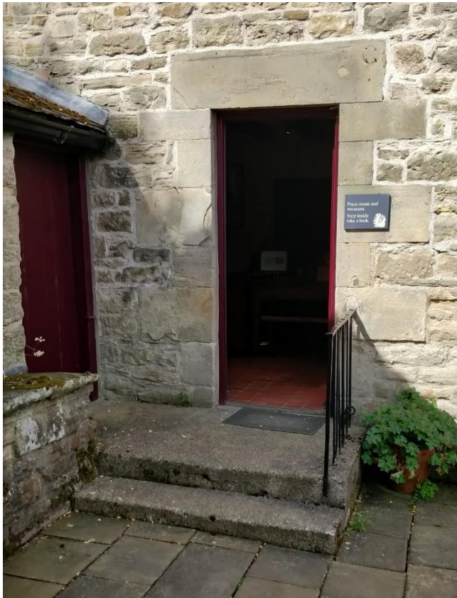
Yard entrance to Press Room