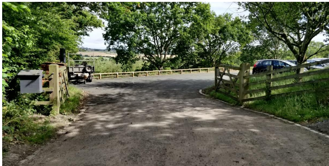
Entrance to Cherryburn car park

There is a drop off point in the courtyard, accessed via the right-hand gate