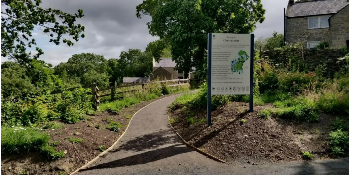
Path from car park.