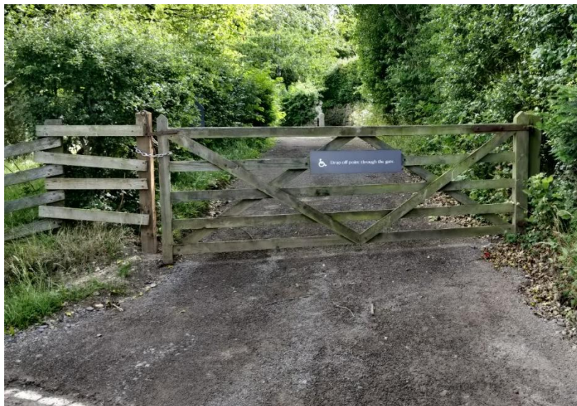
Gate to drop off point.