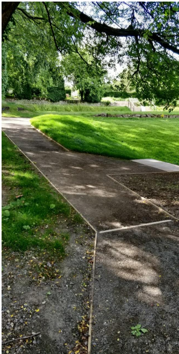
Path from Farmhouse to lawn and upper garden.

Paths a mixture of stone, fine material and grass, sometimes uneven.