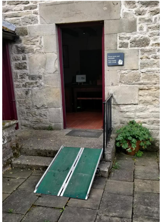
Yard entrance to Press Room with temporary ramp in place.