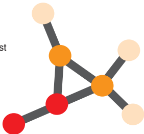
Molecular ancestry network