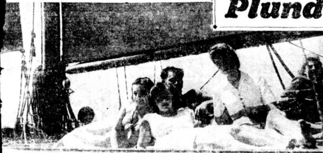
A yachting party lounge on deck, providing a picture of sunshine and beauty.