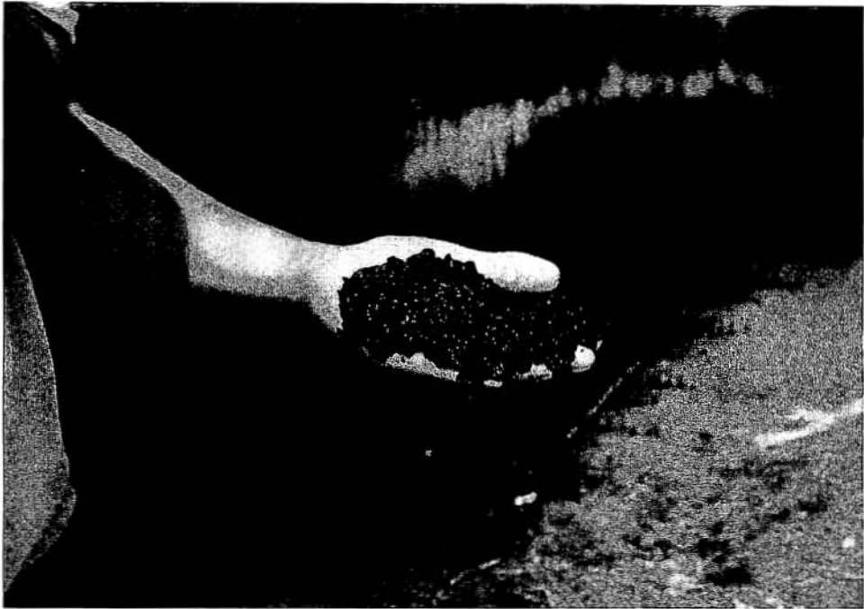
FIGURE 3.— Cocolin [ Phormidium tenue (Meneghini) Gomont] collected from the Sosa Texcoco canals (October, 1982).