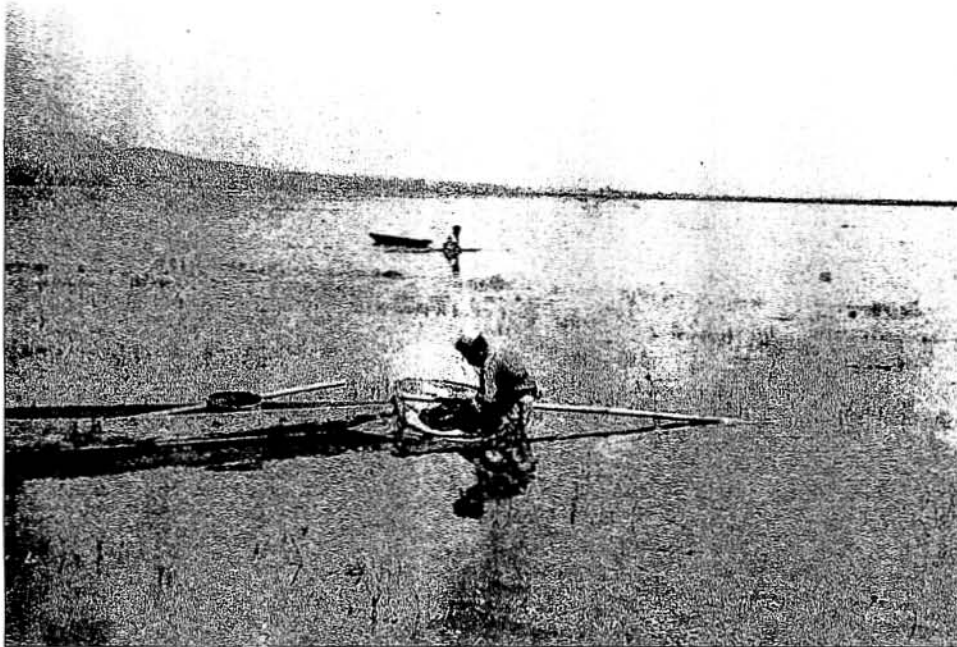
FIGURE 1.— Amoxtle [ Nosctoc commune Vaucher ex Bornet et Flahault] water jelly floating on the Zumpango Lake.

Espinoza Abarca et al. (1985:61-62) collected this plant in Mixquic, D.F. in December, 1980; it was used as green manure and was identified as Azolla filiculoides Willdenow in symbiotic association with Anabaena azollae Strasburger [ Trichormus azollae (Strasburger) Komárek et Anagnostidis].