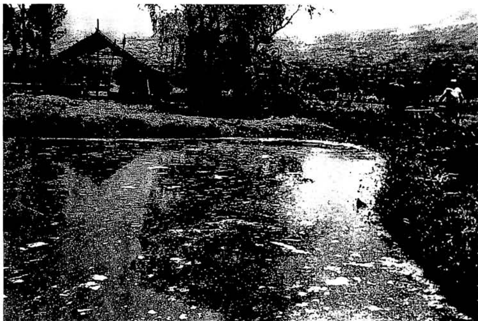
FIGURE 2.— Chilacastle floating on the canals of Mixquic, Xochimilco, D.F. (March 23, 1972).