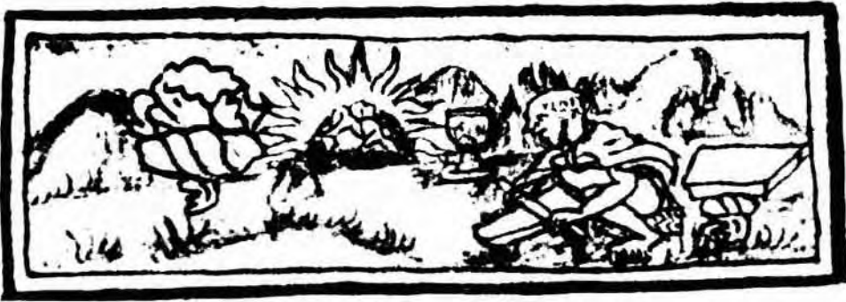
FIGURE 11.— Image from the Florentine Codex interpreted by Dibble and Anderson (1963:fig. 821). Preparation of tetizatl .

Clavijero between 1780-1781 (1945:315) states: "The white part of the mineral stone called chimaltízatl , once it is burnt to ashes, or of the tizatlalli , which is a mineral soil found in the lake, which is kneaded with mud and made into balls; when cooked, it becomes white just as the "albayaide" from Spain." ("El blanco de la piedra mineral chimaltízatl después de calcinada, o del tizatlalli , que es una tierra mineral que se halla en la laguna la cual amasada como lodo y reducida a pelotas, recibe con la acción del fuego un color blanco semejantísimo al del albayaide de España.")