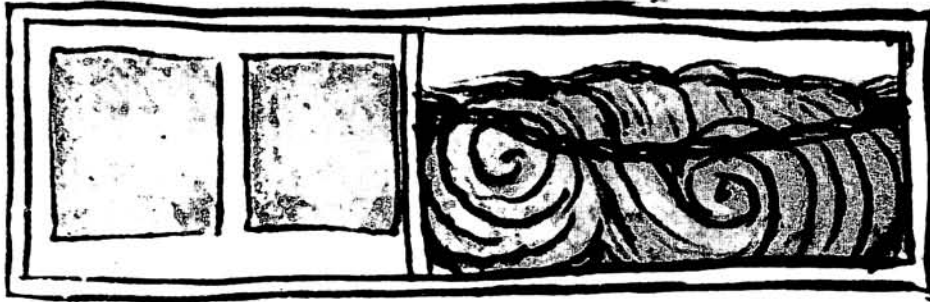
FIGURE 9.— Images from the Florentine Codex interpreted by Ortega (1972:87) and Dibble and Anderson (1963:fig. 227). Two blue-green plates (in the original) prepared with tecuítlatl .

con maíz tostado o con las comunes tortillas de los indios. Cada venero de este limo tiene su dueño particular, a quien rinde a veces una ganancia de mil escudos de oro anuales. Tiene sabor de queso, y así lo llaman los españoles, pero menos agradable y con cierto olor a cieno; cuando reciente es azul o verde; ya viejo es de color de limo, verde tirando a negro, comestible sólo en pequeña cantidad, y esto en vez de sal o condimento del maíz. En cuanto a las tortillas que hacen de él, son alimento malo y rústico, de lo cual es buena prueba el hecho de que los españoles, que nada desprovechan de lo que sirve al regalo del paladar, sobre todo en estas tierras, jamás han llegado a comerlas”).