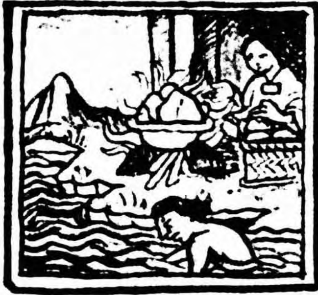
FIGURE 10.— Image from the Florentine Codex interpreted by Dibble and Anderson (1963:fig. 820). Preparation of tizatl .