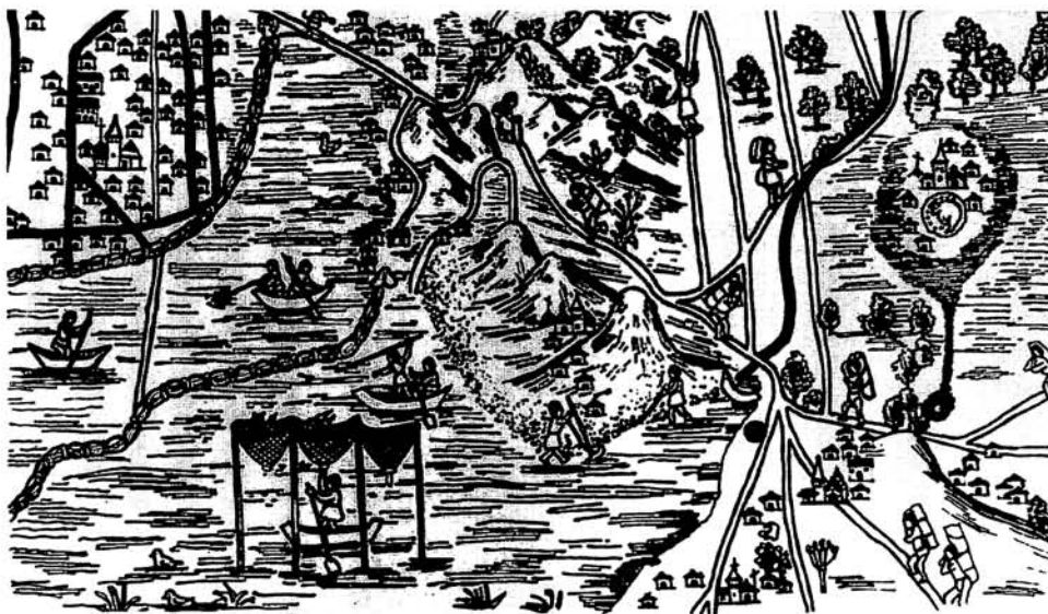
FIGURE 7.— Detail of the Upsala Map (16th century). In the upper left hand corner, people collecting algae can be seen.