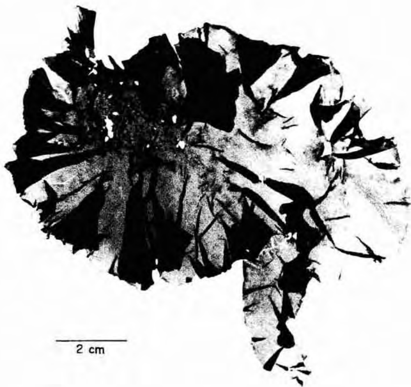
FIGURE 6.— Nitla or Prasiola mexicana J. Agardh collected from the Ocuilan River, State of Mexico (December 18, 1981).