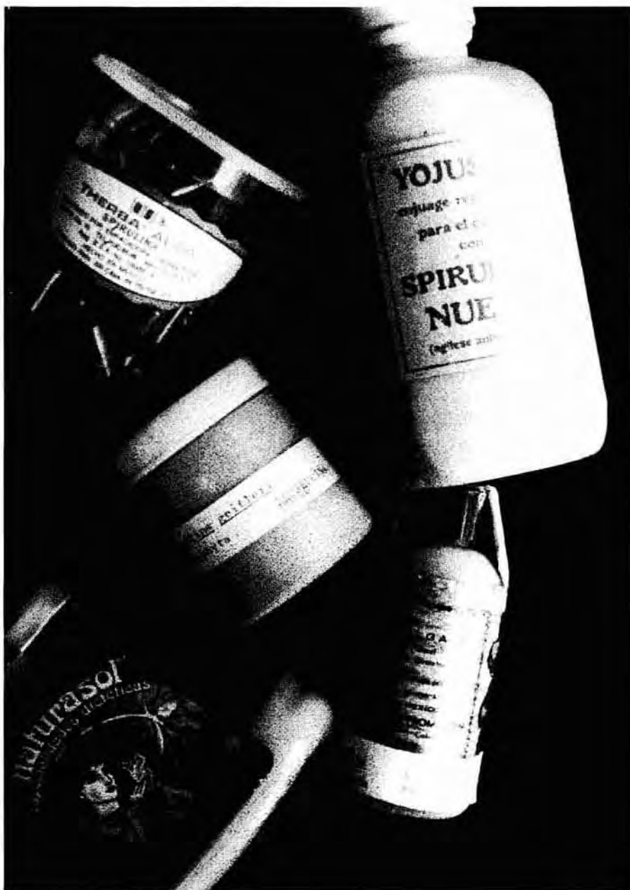
FIGURE 5.— Products made of Spirulina .

Chronology: Since 1967, after the recognition of the existence of Spirulina geitleri De Toni in lake Texcoco, Sosa Texcoco Company, in collaboration with the French Institute of Petroleum, studied and cultivated Spirulina for twenty years (Sosa Texcoco 1976:6). Research on Mexican Spirulina during the 1970s and 1980s was extensive. The bibliography can be consulted in Ortega (1987).