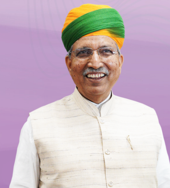
Shri Arjun Ram Meghwal Hon'ble Minister of State, Ministry of Law and Justice (Independent Charge)