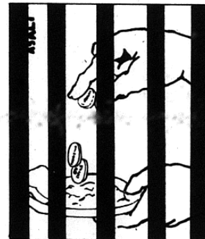
Drugs secretly placed in food turn prisoners into vegetables.

for no apparent reason and then fainted. Many feel dizzy and tired all day long. All prisoners who were polled recently said they felt stranger and sleepier than they did before they were transferred to Napanoch.