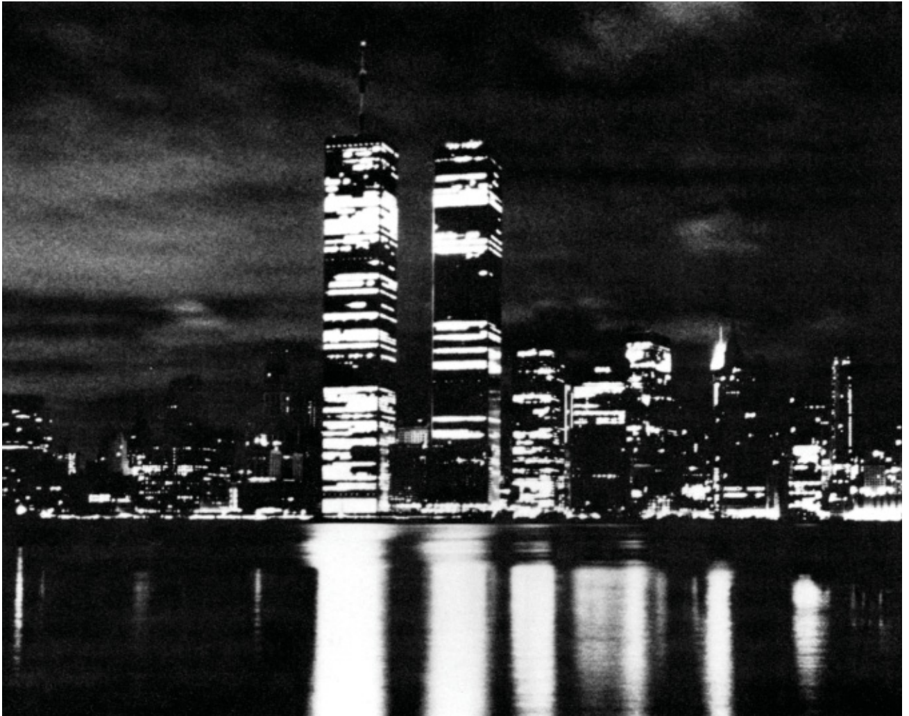
Port Authority of New York and New Jersey

T HE WORLD TRADE CENTER IS AMONG THE MOST FAMOUS BUILDING COMPLEXES IN THE WORLD. More than almost any other architectural development, it has reshaped the physical image of New York. The glistening, metallic twin towers have become an icon in the panoramic skyline of lower Manhattan, even as they have altered its character.