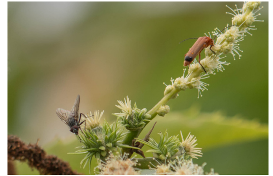
Grégoire Pauly et al. 2023. Adaptive function of duodichogamy: Why do chestnut trees have two pollen emission phases?. American Journal of Botany https://doi.org/10.1002/ajb2.16204

Chestnuts are one of the few plants that emit pollen twice during flowering. The adaptive function of this unusual flowering strategy, called duodichogamy, is unclear. Pauly et al. present a novel hypothesis that duodichogamy increases female, rather than male, mating success. To test this hypothesis, the authors monitored pollinator visits to chestnut flowers throughout the entire flowering season. The numerous unisexual male catkins release pollen first, followed by the less numerous bisexual catkins. In chestnut, only male inflorescences produce nectar and attract insects. Observations revealed that most pollinator visits to female inflorescences take place during the second male flowering phase. This suggests that duodichogamy plays a key role in female mating success by ensuring pollen deposition on stigmas due to the attractiveness of closely associated male flowers—and effectively limiting self-pollination. This work on chestnut thus shows that the consideration of intersexual mating facilitation results in a better understanding of the evolution of flower or inflorescence organization.