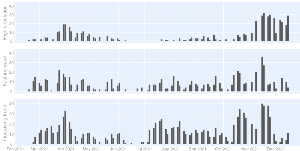
Figure 3: The number of areas (among the 41 covered by the wastewater surveillance this week and the 42 normally considered), with positive alerting indicators (latest results on December 15th 2021).

The covered areas of Destelbergen, Harelbeke, and Roeselare had at least one indicator fulfilled last week but not this week. Details on covered area without fulfilled indicators can be found in Table A4. Figure 3 was developed to offer a dynamic view of the three indicators over time. For further insights on the dynamic of the different indicators, see Section 3.3. The number of "High circulation" areas is high and fluctuating since five weeks. Taking the Fast increase and Increasing trend indicators into account, the overall situation is assessed to have an decreasing trend.