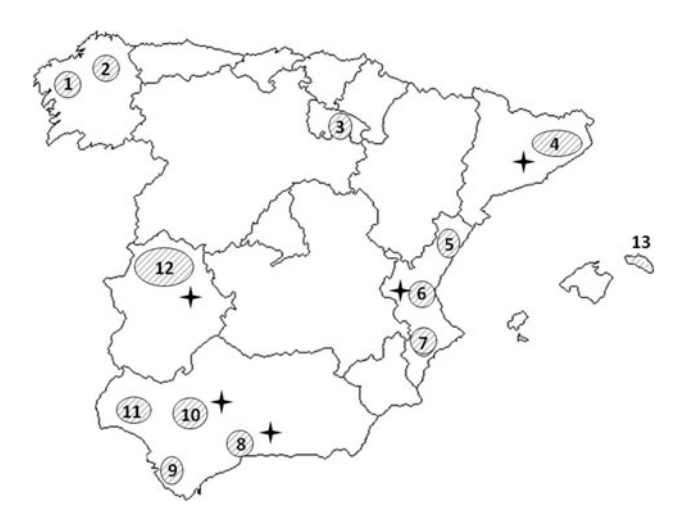
Fig. 1 Geographical location of bat capture sites in Spain. 1: A Coruña, 2: Lugo, 3: La Rioja, 4: Gerona, 5: Castellón, 6: Valencia, 7: Alicante, 8: Málaga, 9: Cádiz, 10: Sevilla, 11: Huelva, 12: Cáceres, 13: Menorca. The stars show the locations where positive samples were found

Oro-pharyngeal swabs collected between 2004 and 2006 were preserved in 1 ml of lysis buffer (4 M GuSCN (Sigma), OS% N-lauroyl Sarcosine (Sigma), 1 mM dithiothreitol (DTT, Sigma), 25 mM Sodium Citrate and 20 pg/tube Glycogen (Boehringer Mannheim). Oro-pharyngeal swabs and faeces collected in 2007 were preserved in both 1 ml of lysis buffer and 1 ml of viral transport medium (VTM) (Eagle's minimal essential medium (EMEM) supplemented with 10 UI/ml of penicillin, 10 µg/ml of streptomycin, 160 µg/ml of gentamicin, 50 UI/ml of mycostatin and 1% of