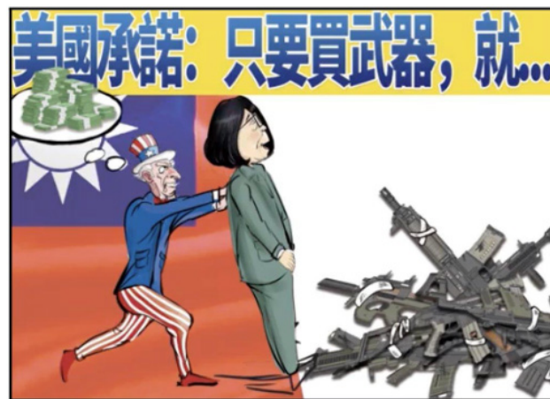
Image: “America Promises: As Long as You Buy Weapons...” Uncle Sam pushes Tsai Ing-wen to purchase cast-off US weapons. This was a sponsored image circulated on social media in Taiwan in October 2022. 42

This line of propaganda messaging also depicts Taiwan’s arms purchases as wasteful spending, which could be better applied towards social services. In one such example, the CCP’s official Xinhua News Agency issued an August 2021 commentary about an announced round of arms sales to Taiwan, claiming that people throughout Taiwan were “crying out to the Democratic Progressive Party authorities, ‘Taiwan needs vaccines not weapons’” (對民進黨當局喊話, “台灣要的是疫苗不是武器”). 41 It is also a common propaganda line to depict US arms sales as composed of overpriced and antiquated equipment—for which Taiwan officials overpay, as a means to secure broader US support—as depicted in the cartoon below, which was circulated to Taiwan social media users in autumn 2022.