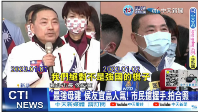
Image: New Taipei City Mayor Hou You-yi speaking at a public event on New Year's Day 2023, in which he told the assembled crowd that "Amid the Ukraine war, and US-China competition... Taiwan cannot stay uninvolved... [but] we are absolutely not a powerful country's chess piece." 24

candidate of the Taiwan People's Party (民眾黨). In a public appearance in July 2023, Ke expressed his hope that Taiwan would become "a bridge for communication between America and China," but that it would "not be a chess piece in America-China confrontation" (而不是美中對抗的棋子). 25