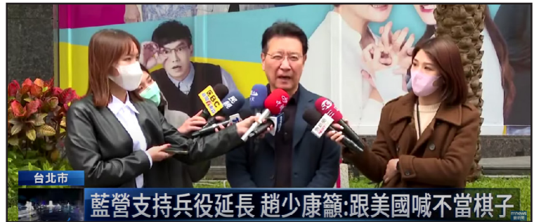
Image: Outspoken media commentator Jaw Shaw-kong speaking to reporters in Taipei (Jan. 3, 2023). In his comments, Jaw demanded “Is the Kuomintang capable or not of boldly saying to America, ‘I am not your chess piece?’” 13

Such narratives have also become prominent in certain sectors of Taiwan’s pro-unification “Pan-Blue” broadcast media. For example, in an interview in January 2023, the firebrand political commentator Jaw Shaw-kong (趙少康)—who has become a prominent Taiwan media personality known for intemperate anti-American and pro-Chinese views—harshly criticized Kuomintang Party (KMT, 國民黨) political figures for allegedly following excessively pro-American policies. He harshly demanded, “Is the Kuomintang capable or not of boldly saying to America, ‘I am not your chess piece?’” (“國民黨能不能大膽的跟美國說我不是你的棋子?”).