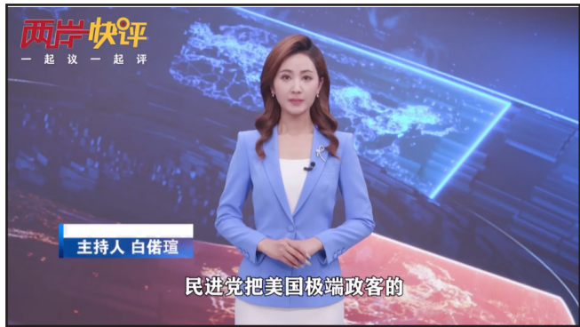
Image: “The Democratic Progressive Party has actually turned [itself] into the ‘ravings’ and ‘jokes’ of American extremist politicians” (民進黨把美國極端政客的“瘋話”“笑話”變成現實). A news video from PRC state media directed at Taiwan, which promotes the message that government officials in Taiwan are “selling out” the island to the United States. 38

te. The embassy letter denounced Lai as “show[ing] his loyalty to his American patron” by “sell[ing] out Taiwan to the U.S.,” and summed up by asserting that “the DPP’s attempt to sell out Taiwan is despicable. Seeking independence is doomed to fail.” 39