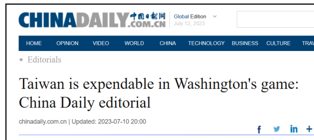
Image: A headline from China Daily (a primary English-language Chinese state media publication) promoting the narrative of Taiwan’s role as an “expendable” pawn of the United States. The editorial stated that “secessionists on the island... can stand on the right side of history and work with Beijing for the peaceful reunification of the island with the motherland, or do Washington’s bidding and sacrifice the island on the altar of the US’ hegemony.” 2

PRC state propaganda directed at both Taiwan and international audiences. Direct PRC state sources tend to employ a certain element of circumlocution in terms of identifying America as a source of support for “Taiwan independence separatism” (台獨分裂)—tending instead to use veiled terms such as “outside interference schemes” (外來干涉圖謀) or “foreign forces” (外部勢力), with the United States clearly insinuated as the guilty party. 3 Despite their veiled inferences to the United States when it comes to the