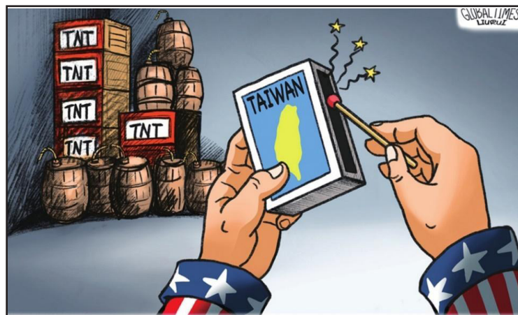
Image: This political cartoon from PRC state media depicts Uncle Sam exploiting Taiwan—and as presented elsewhere, America’s treaty allies in Asia—to contain China. As a result, Uncle Sam is recklessly creating a powder keg that threatens to blow up peace in the Asia-Pacific region. 35

This instance of the US Department of Defense approving arms sales to Taiwan is another example of America “playing the Taiwan card.” Under the current circumstances of cross-Strait relations, this sort of irresponsible American conduct not only sends a serious mistaken signal to “Taiwan independence” forces, [but also] aggravates tensions and the complicated situation in the Taiwan Strait [...] “Using Taiwan to Contain China” has never worked in the past, it cannot work in the present, and cannot work in the future. 34