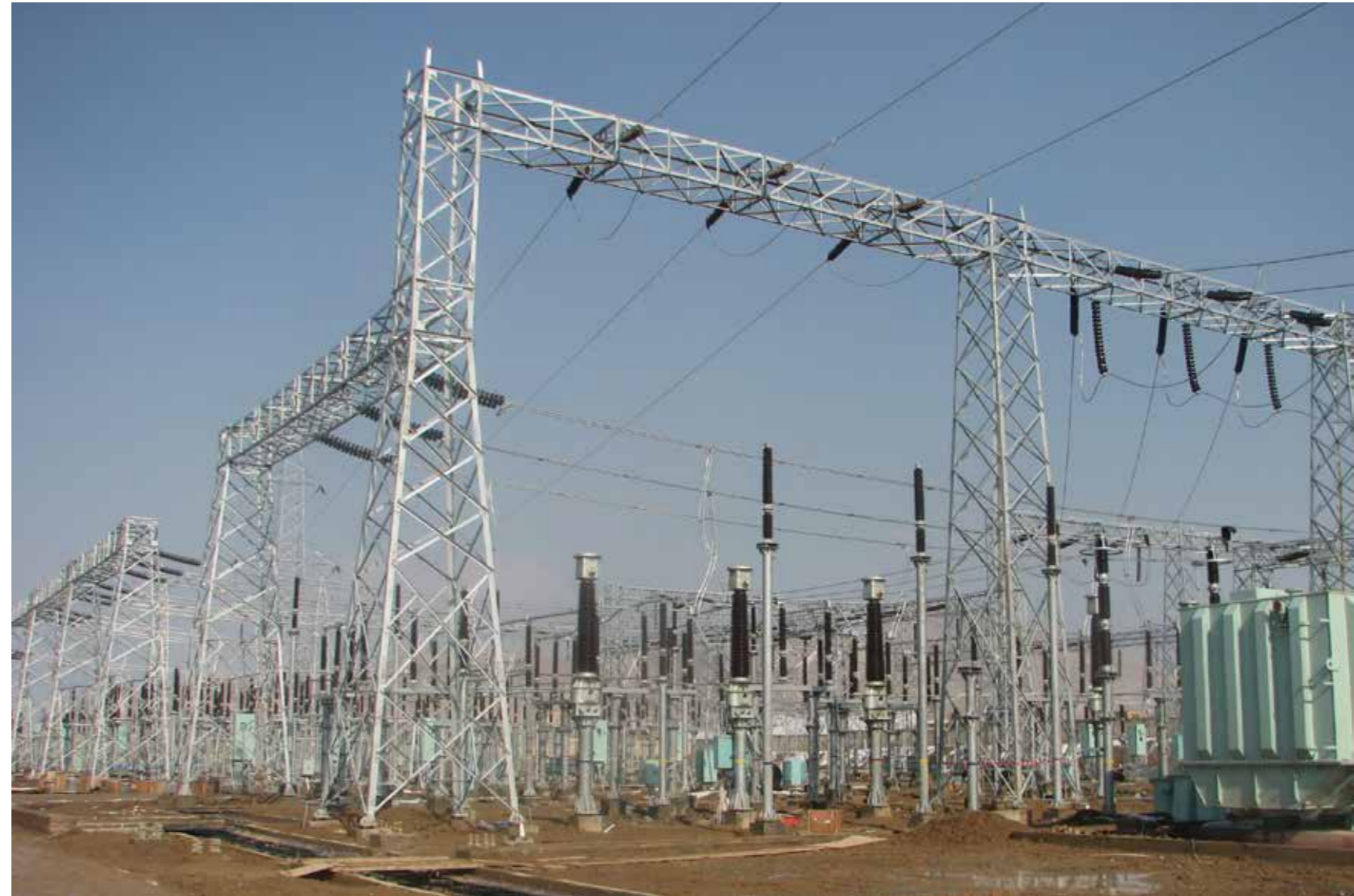
The CASA-1000 project is making good progress to build more than 1,200 kilometers of electricity transmission lines to transmit excess summer hydropower energy from existing power plants in Kyrgyz Republic and Tajikistan to Pakistan and Afghanistan.

At approval, CASA-1000 included the engineering design, construction, and commissioning of high voltage alternating current (HVAC) transmission lines and associated substation in Kyrgyz Republic and Tajikistan; high voltage direct current (HVDC) trans-