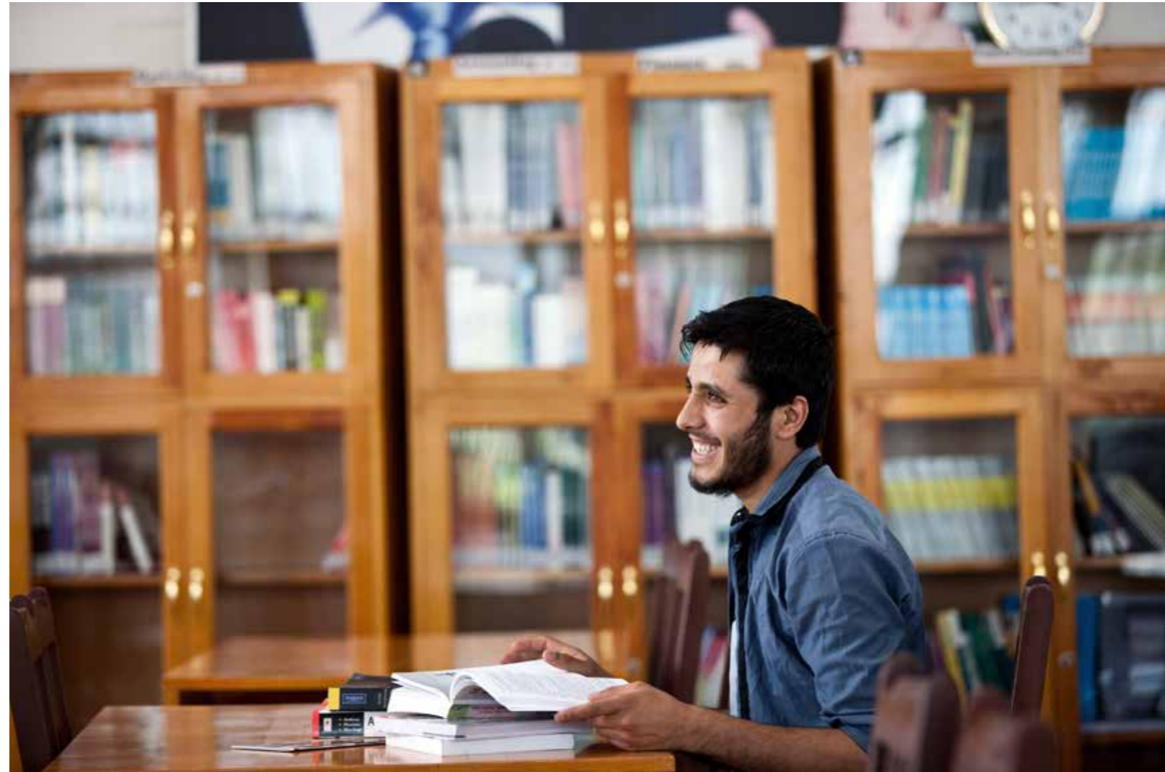
An Alternative Learning Program through distance learning has been developed under ASDP II in response to the closure of TVET schools and institutes due to COVID-19 measures.

Primary beneficiaries are students in general education, out-of-school children in lagging provinces (never enrolled or dropped out), teachers, principals, and Ministry of Education (MoE) staff. The system-level improvements in management will benefit all