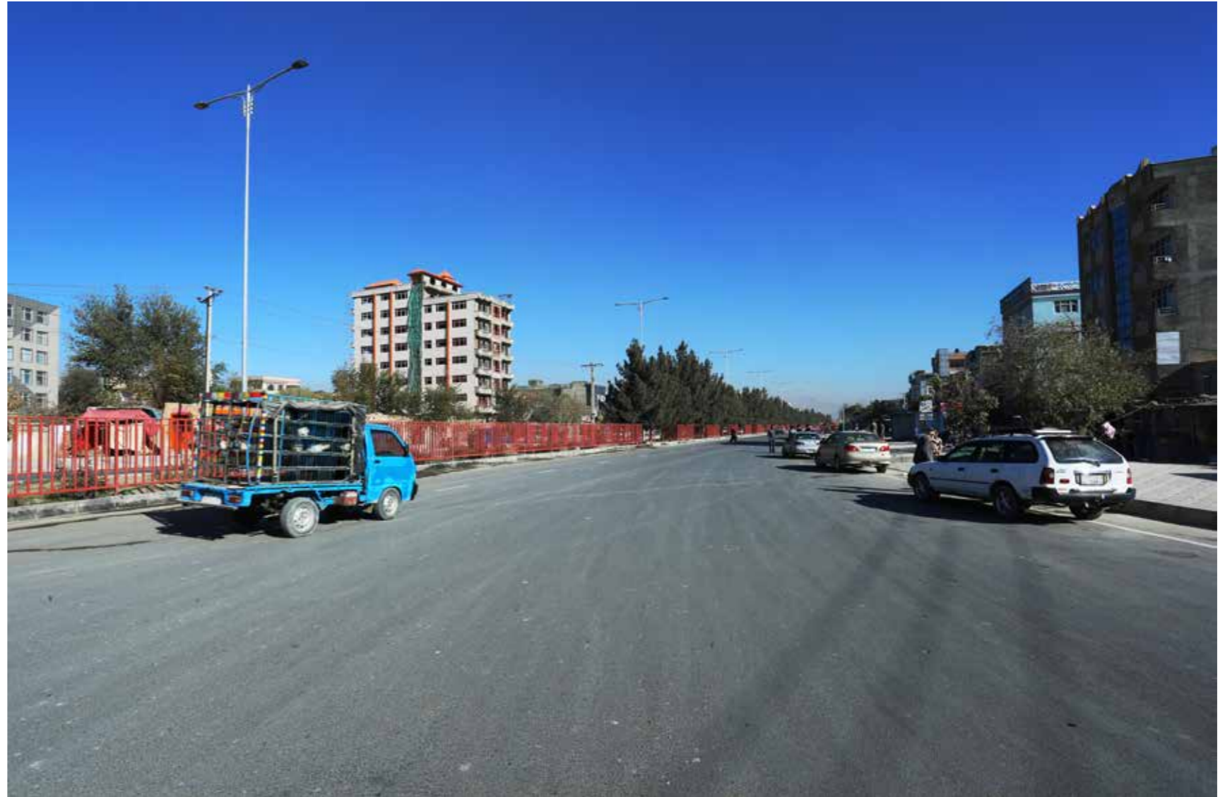
Support from the Urban Development Support Project will enhance urban policymaking capacity at the national level, as well as strengthen city planning, management, and service delivery capacity in Herat, Jalalabad, Kandahar, Khost, and Mazar-e-Sharif.

Component 4: Urban Investments: Feasibility and Design Studies for Urban Infrastructure. Preparation of a pipeline of priority projects (no regret, quick-win projects) in the five PCCs, including detailed feasibility and design studies.