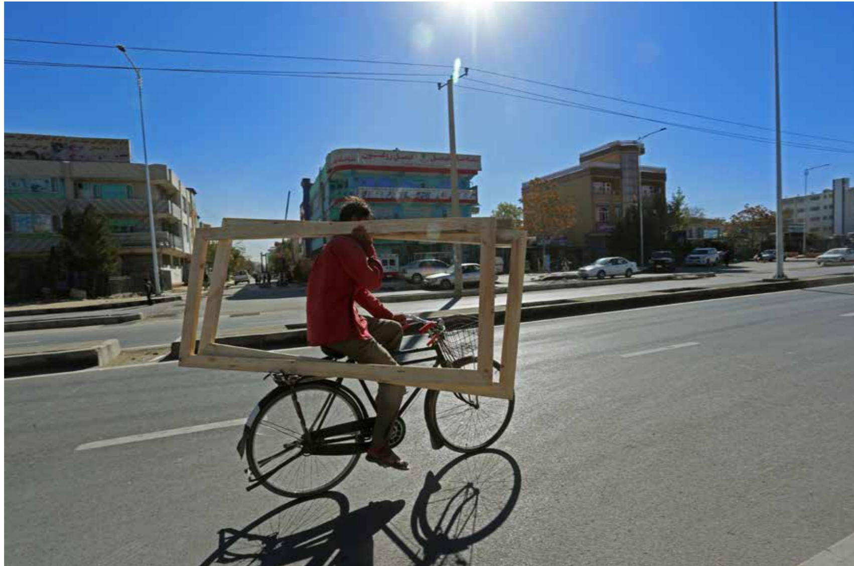
CIP supports COVID-19 recovery efforts in five provincial capital cities, including creating short-term, labor-intensive “Emergency Projects”, which are designed to provide rapid employment opportunities to daily laborers who lost their livelihoods due to the pandemic.