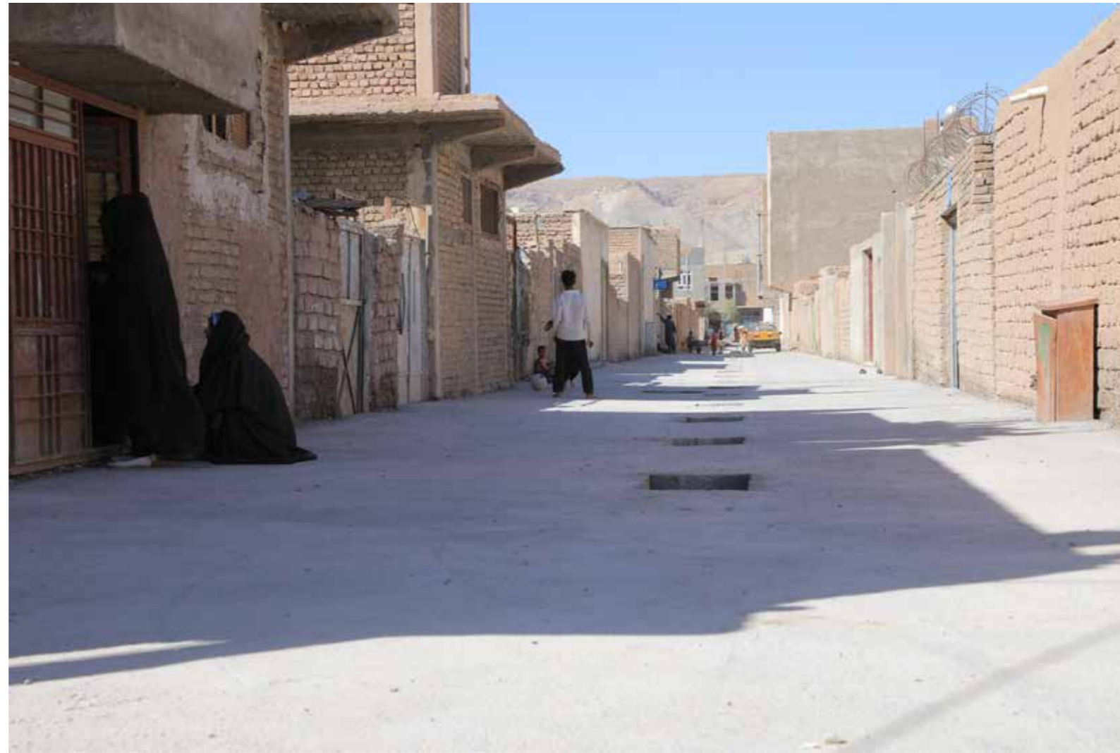
CASA-CSP, which aims to support communities close to the route of the CASA-1000 transmission line in Afghanistan, has reached out to over 670 communities. CSP social mobilizers in communities covered by the CCAP have focused on subproject implementation and building support for the transmission line, satisfactorily communicating the additional benefits provided by CSP to the targeted communities.

It should also be highlighted that the RCW resources are national in scope, ensuring the payment of salaries of around 62 percent of non-uniformed civil servants in all 34 provinces of the country. Steady year-on-year increases in operating costs across government mean the RCW accounts for a declining share of the overall budget.